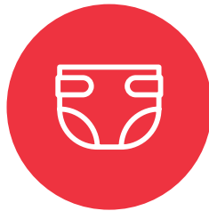
Nappies and sanitary products