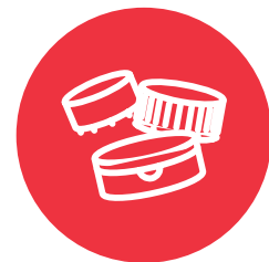
Lids from bottles, jars and containers