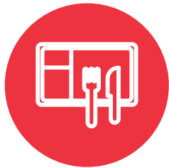
Compostable packaging and containers