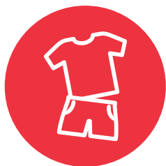
Fabric and clothing