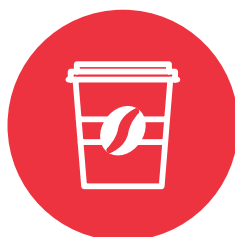
Coffee cups and lids