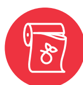
Taga e palagia

Na o otaota meaai e tuu i le kalone mo otaota meaai. E gaosia mai otaota meaai mea e faaleleia ai le palapala. E ola lelei ai fualaau suamalie ma fualaauaina