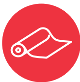
Mea affii meaai