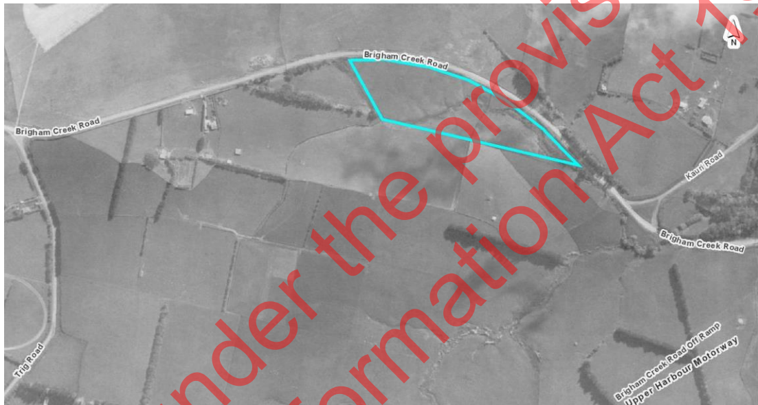
Figure 5. 1959 aerial photograph with subject property bounded in blue.

The earliest photograph located dated to 1959 (Figure 5) and shows the subject property in open grassland with no structures present. It was still undeveloped in 1996 (Figure 6).