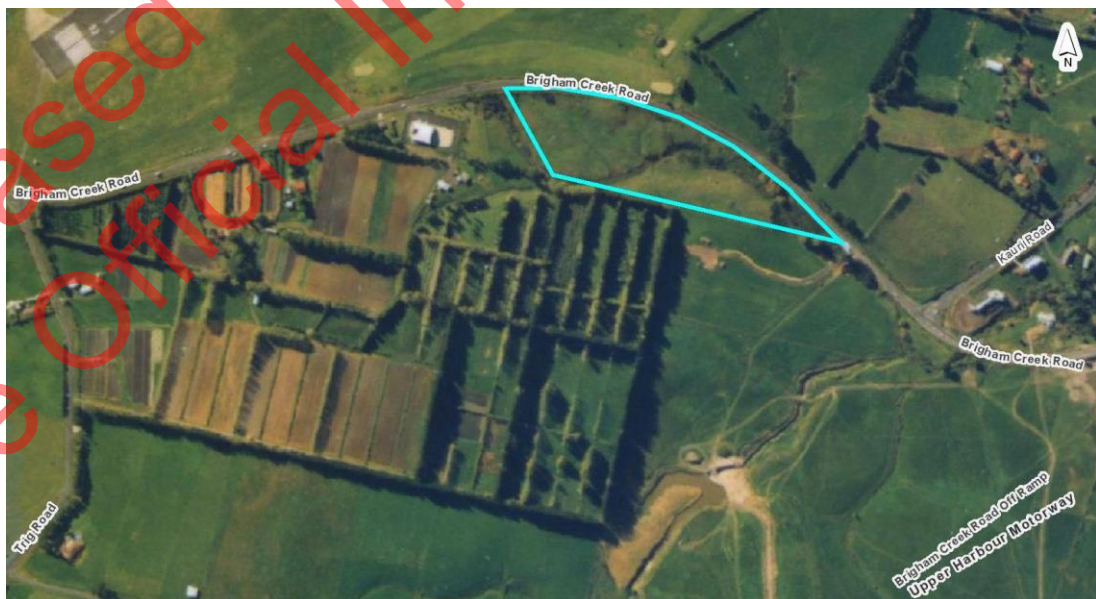
Figure 6 1996 aerial photograph with subject property bounded in blue showing undeveloped pastureland.