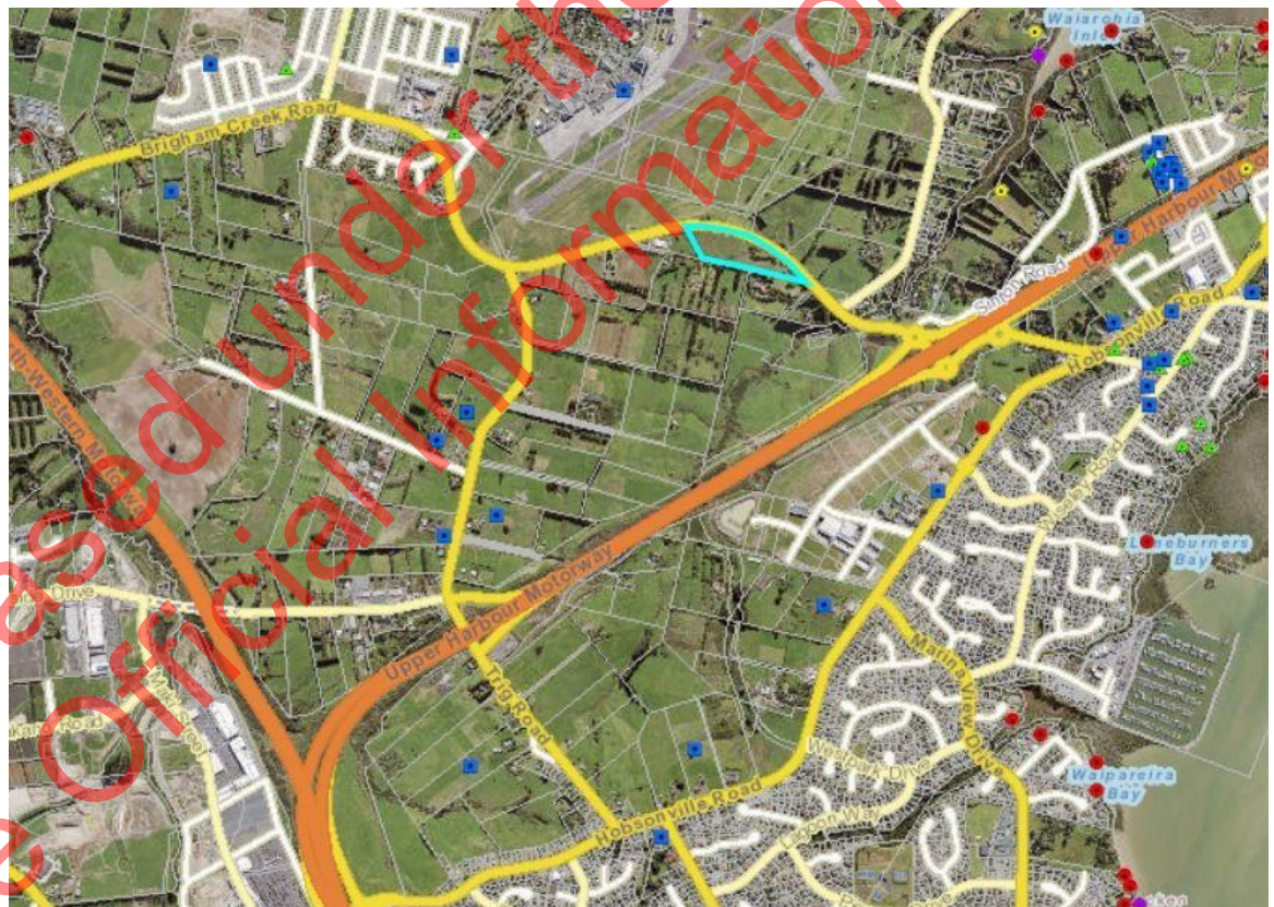
Figure 4. Showing sites of heritage significance within the wider area with the subject property bounded in blue.