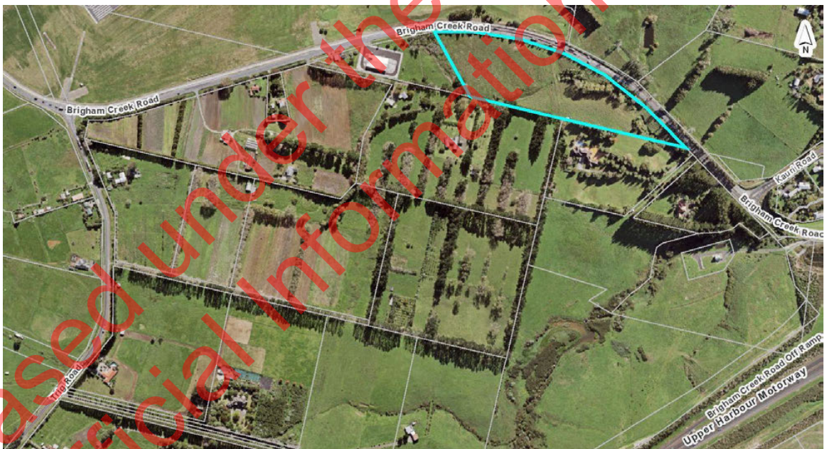
Figure 2. Aerial image of the proposed development area (bounded in blue).