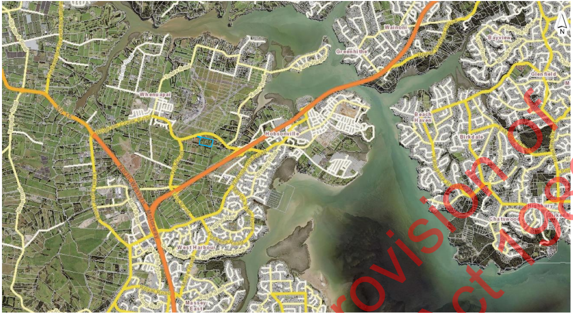
Figure 1. General location of the proposed development at 149-151 Brigham Creek Road (bounded in blue).