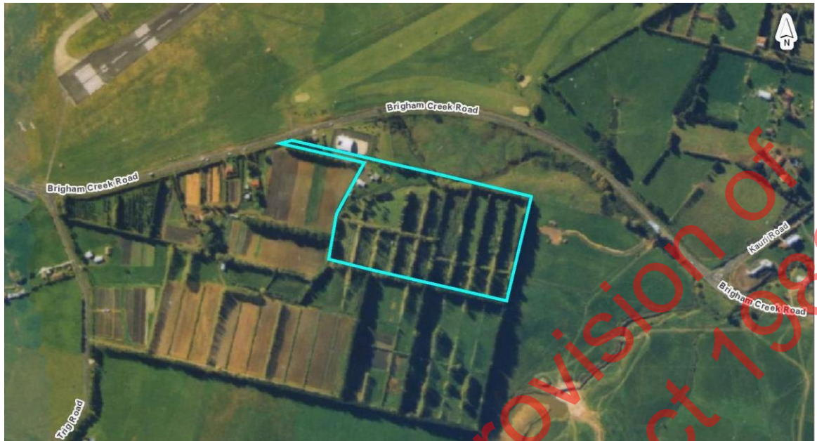
Figure 6. 1996 aerial photograph with subject property bounded in blue, showing the 5.7170ha area of land apportioned into smaller areas bounded by shelterbelts.

Released under the Provision of the Official Information Act 1982