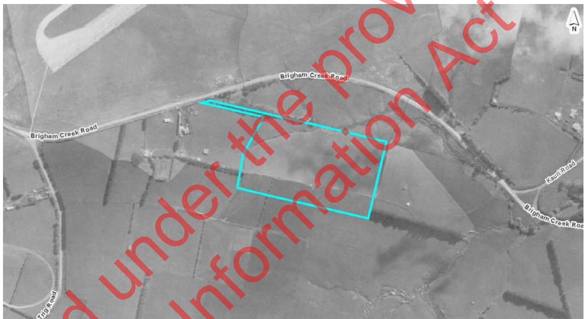
Figure 5. 1959 aerial photograph with subject property bounded in blue.

The earliest photograph located dated to 1959 (Figure 5) and shows the subject property in open grassland with no structures present. By 1996 (Figure 6) land was occupied by a house and sheds with the majority of the land divided into smaller areas bounded by shelterbelt trees.