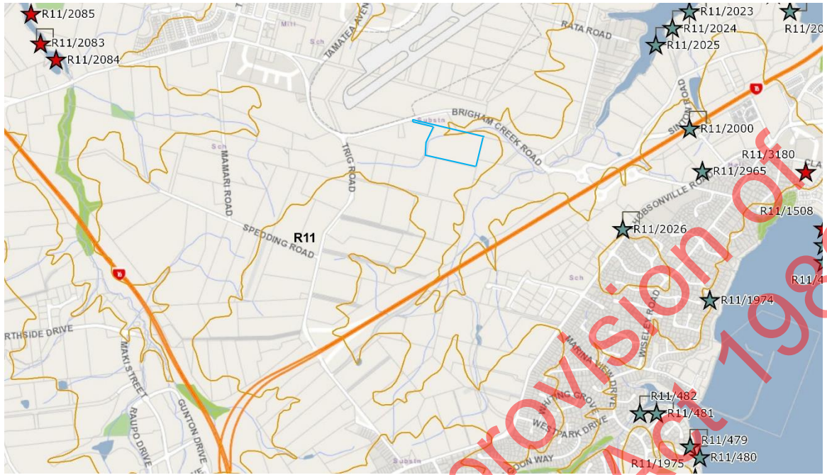
Figure 3. Recorded archaeological sites within the wider area with the subject property bounded in blue.