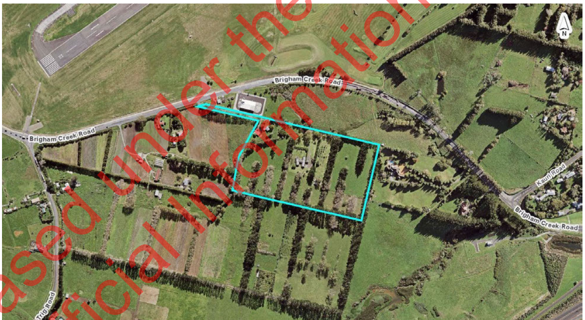
Figure 2. Aerial image of the proposed development area (bounded in blue).