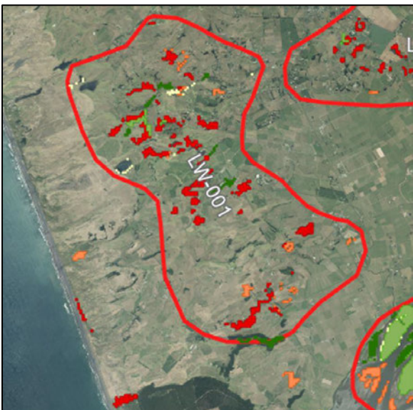
Figure 1: Spatial information – SNA map showing regionally rare vegetation remnants (red denotes highest priority for protection remnants comprising top 5% representativeness of their vegetation type). Bold red outline denotes boundaries for SNA LW-001.

Note: All comments, including your name and contact details, will be made available to the public and the applicant either in response to an Official Information Act request or as part of the Ministry's proactive release of information. Please advise if you object to the release of any information contained in your comments, including your name and contact details. You have the right to request access to or to correct any personal information you supply to the Ministry.