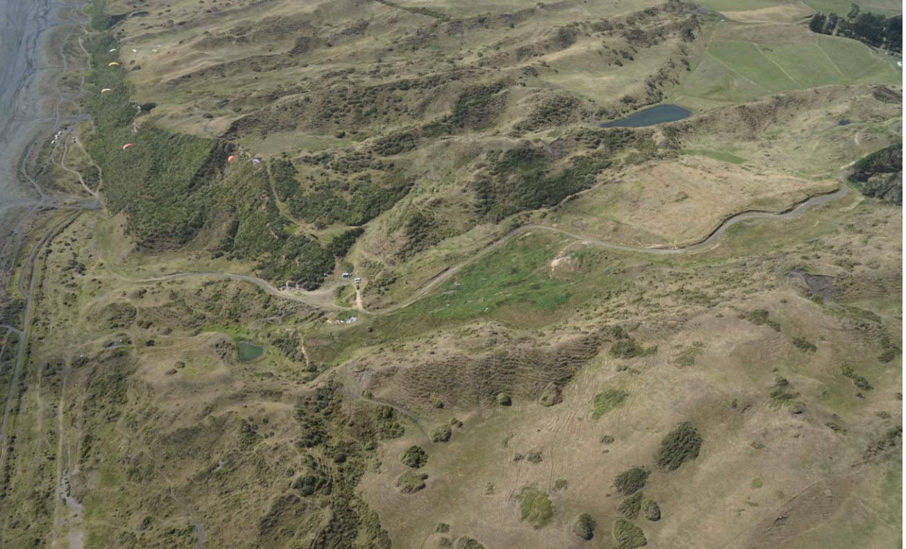
Figure 2: Paragliding photograph.