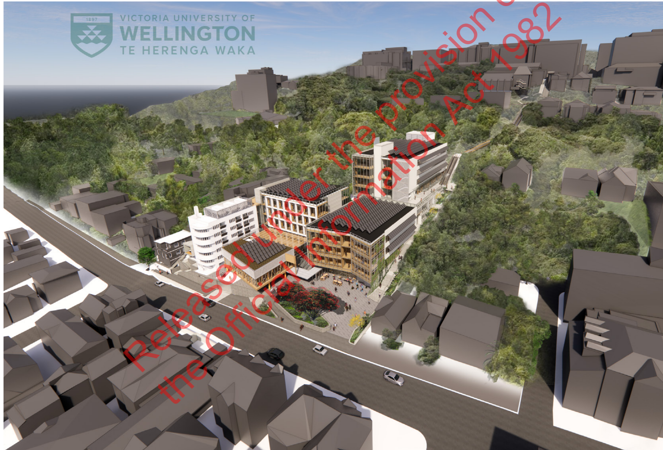
Aerial Perspective from the Terrace.