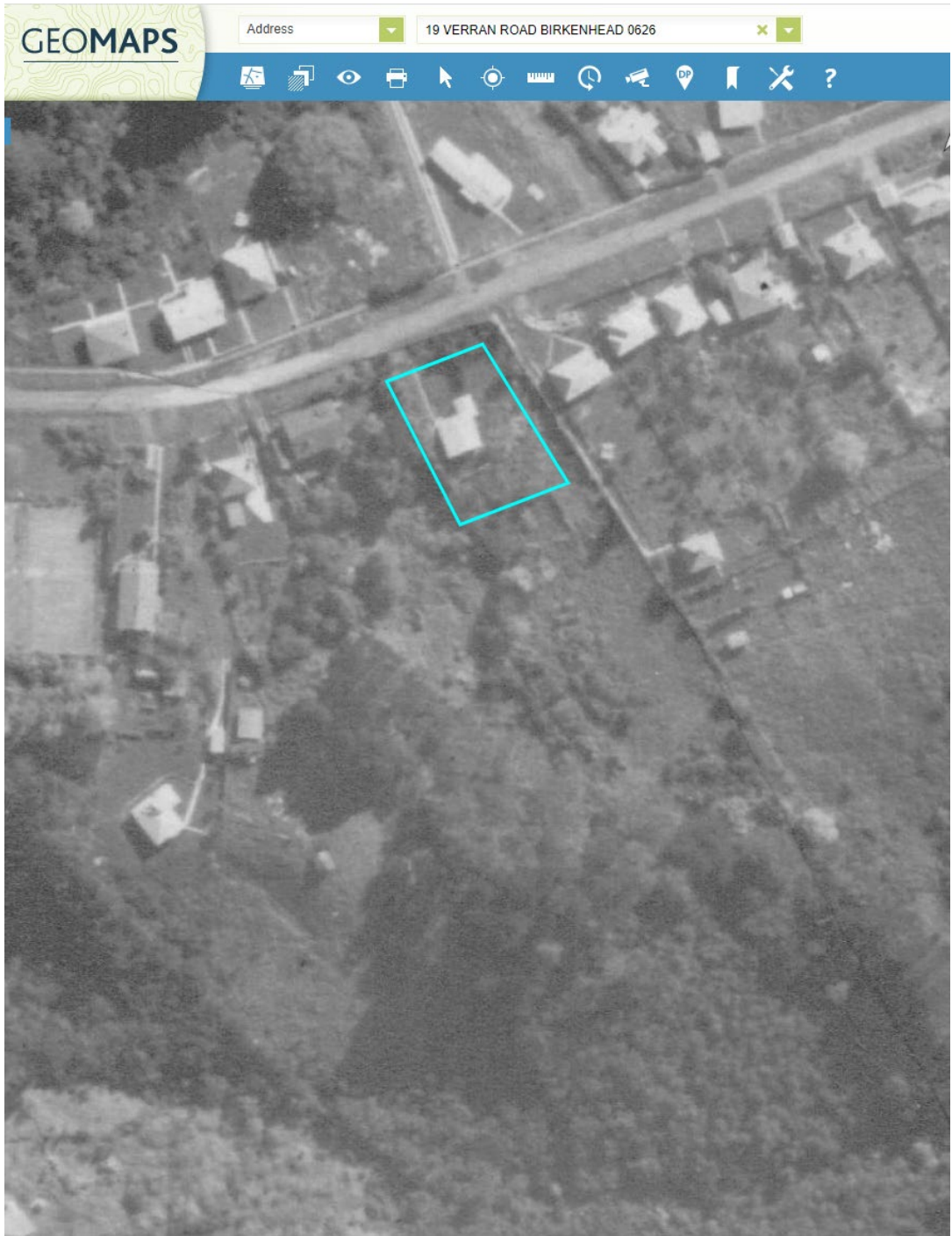
Figure 5 – Historic Photographs