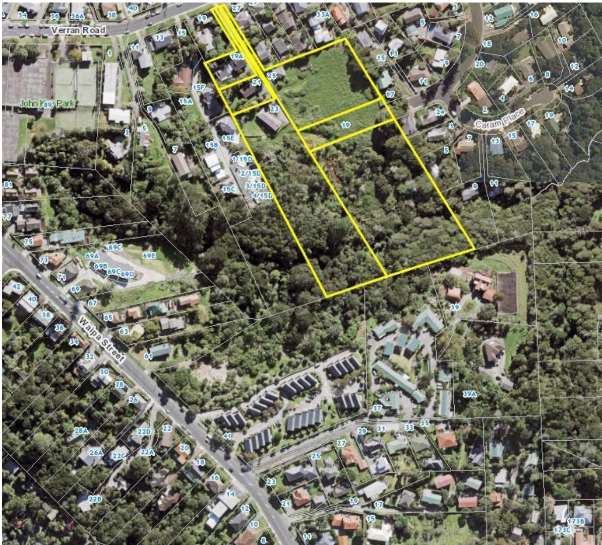
Figure 1 : Subject site, via Council Geomaps