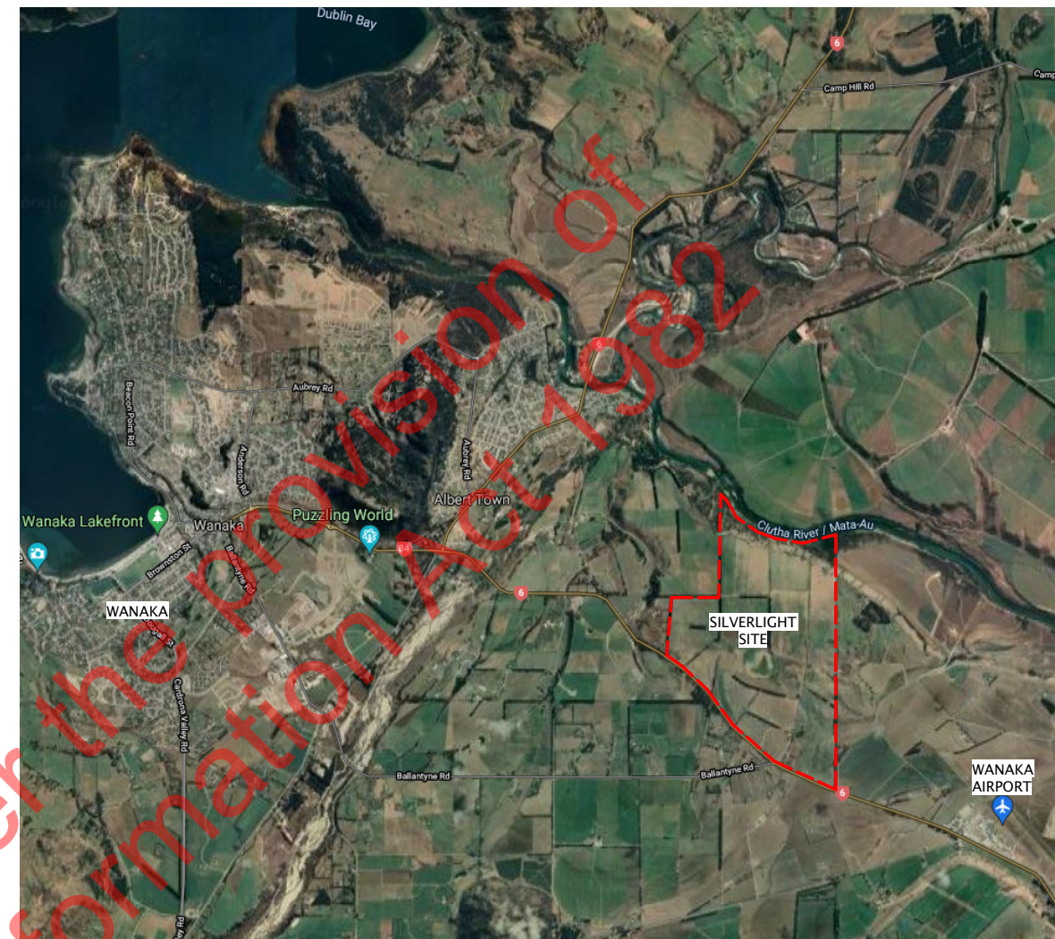
2 SITE LOCATION PLAN