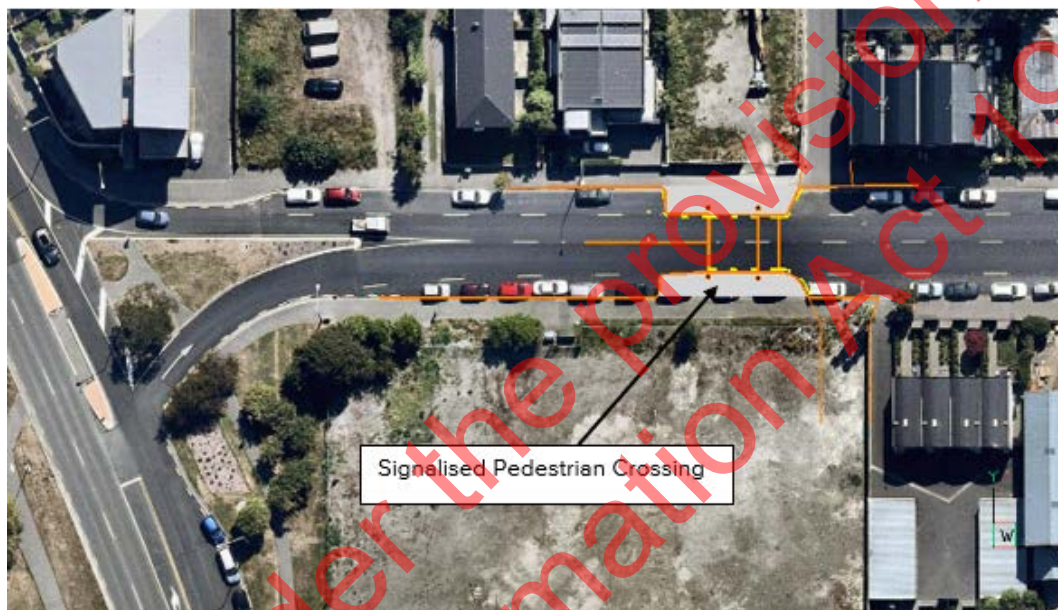
Figure 3: Signalised Pedestrian Crossing

A signalised pedestrian crossing is proposed to provide the greatest performance from a safety perspective and is located on the pedestrian desire line (Figure 2 below).