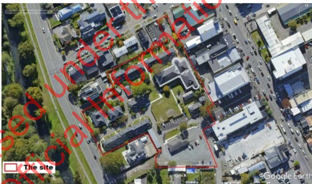
Figure 3: The Bishopspark Site - 100 Park Terrace

The approximately 12,267 m 2 site is flat and relatively regular in shape. The site is located within the Residential Central City Zone of the District Plan. Figure 3 below contains an aerial photo of the site. The Bishopspark site is separated from the Peterborough site by Salisbury Street.