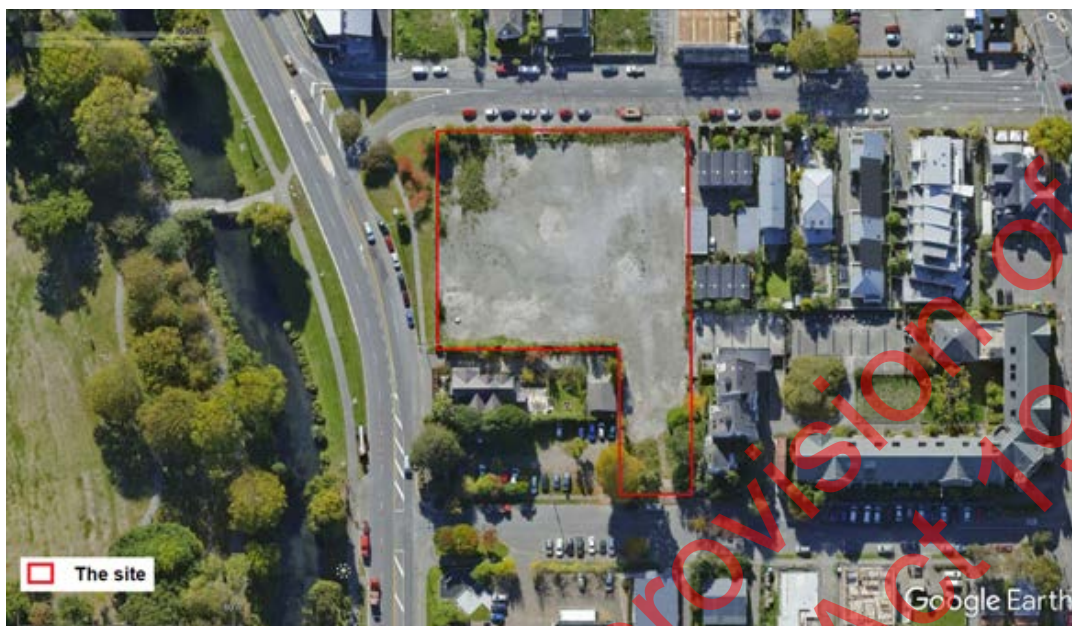
Figure 4: The Peterborough Site - 78 Park Terrace