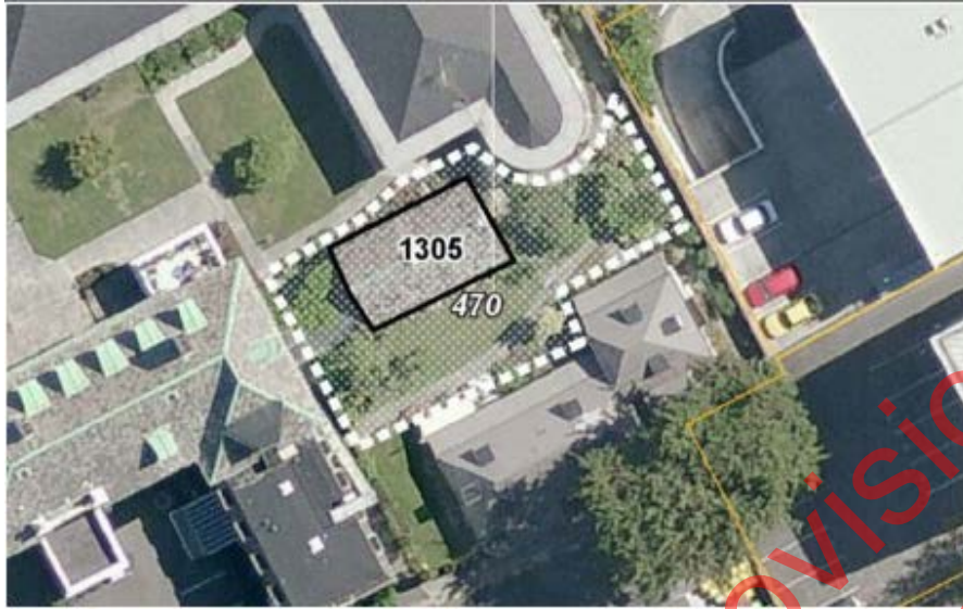
Figure 2: Christchurch District Plan Bishop's Chapel Scheduling and Setting.