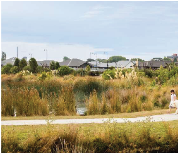
NATIVE SPECIES PLANTING AND EPHEMERAL WETLANDS (STORM WATER MANAGEMENT)