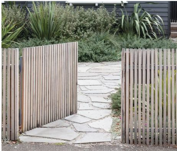
LOW HEIGHT FENCING AT STREET FRONTAGES/ PARK EDGES