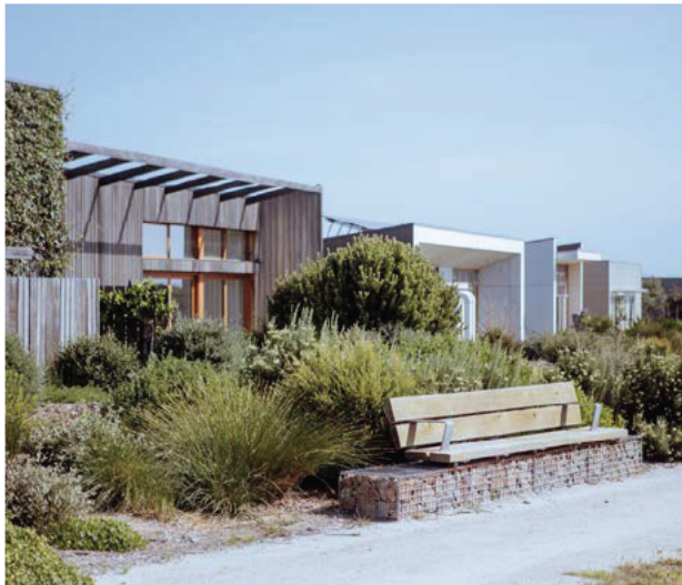
COMBINATION OF PLANTING ELEMENTS AND FENCING TO DEFINE PRIVATE OUTDOOR SPACE