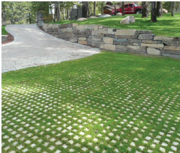
REINFORCED GRASS OR GRAVEL PARKING