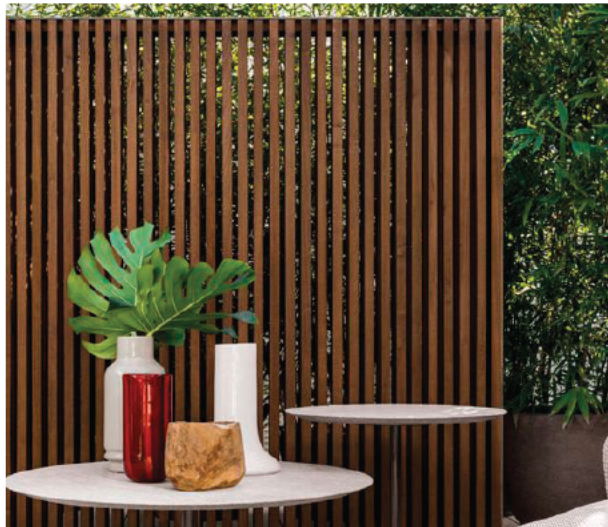
SCREEN FENCING FOR PRIVACY