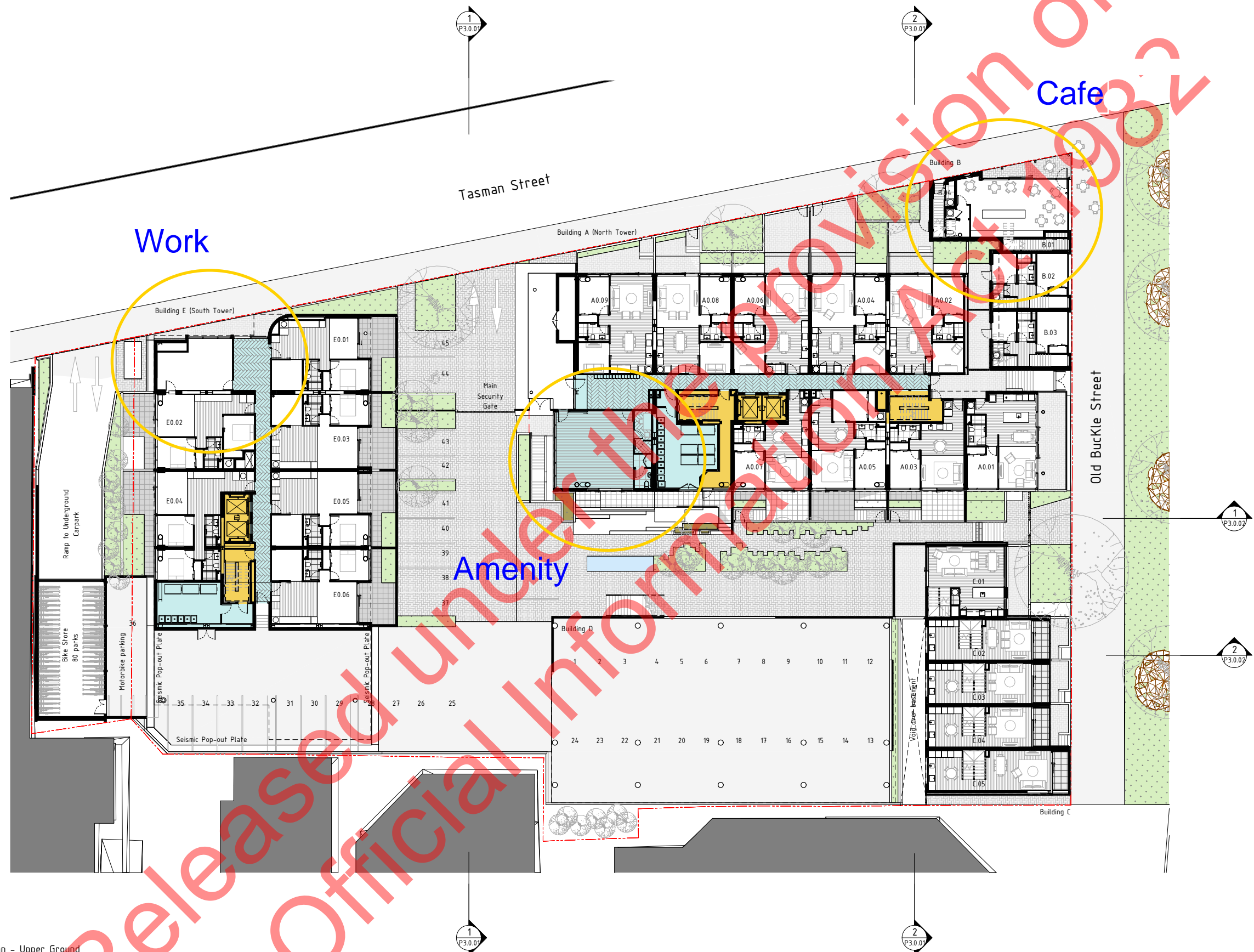
1 | GA Plan - Upper Ground 1 : 200