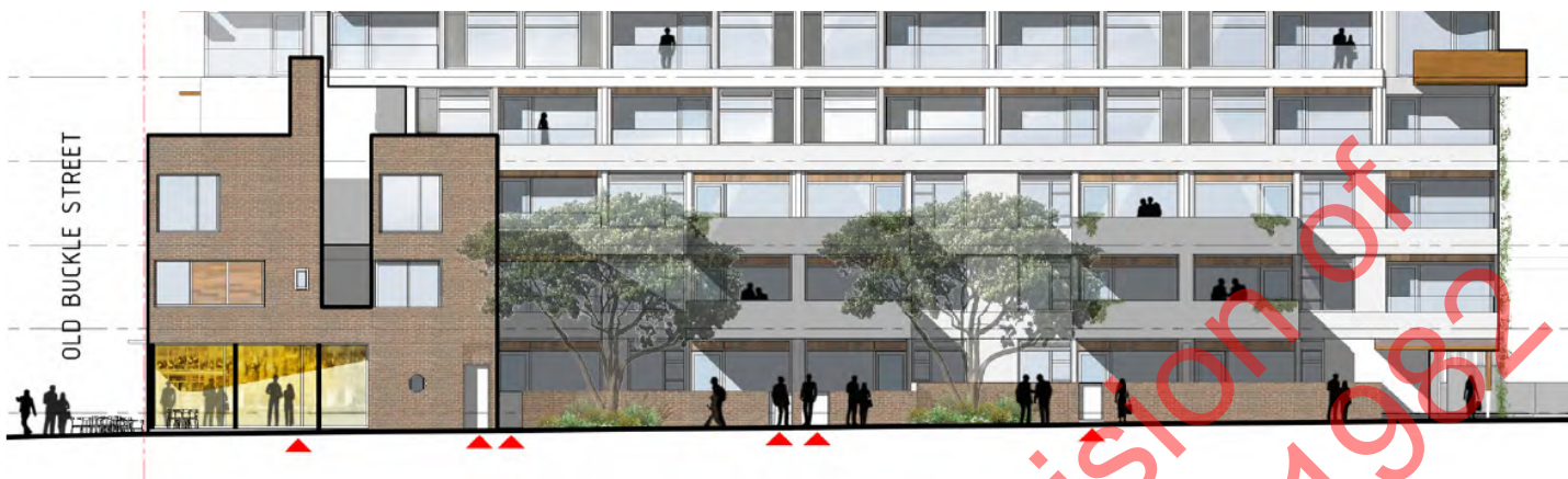
Figure 3: Elevation of the northern part of the Tasman Street elevation, again showing the different conditions along the length of Building A.