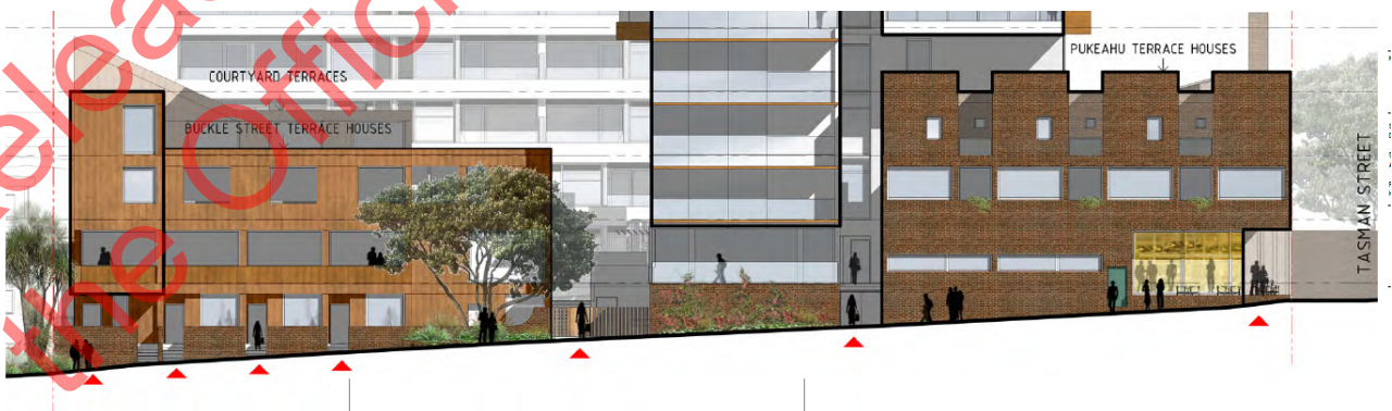
Figure 2: Old Buckle Street elevation showing the different street edge conditions.

The site between and around the proposed buildings would be fully developed with planting, fencing and areas of hard paving. As noted above, a central courtyard space is situated between Buildings A and D and this space is part of a walkway through the site, from Old Buckle Street through to Tasman Street, between Buildings A and E. The street edge conditions vary with the building and topography. Along Old Buckle Street, brick walls separate the at grade private terrace spaces of Building C from the street with stairs between. See figures 2 and 3 below.