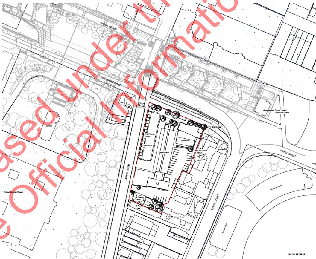
Figure 1: Plan view of the site, located in centre of image and highlighted around its perimeter, and the surrounding setting.

The site has frontages to Old Buckle and to Tasman Street. The relationship with Old Buckle Street is currently mediated by a tall concrete masonry wall, with vegetation evident above it. One of these plants is a large and symmetrical Pohutukawa, which would be retained in the proposed scheme. The frontage to Tasman Street comprises a series of terrace houses with individual garages and entries. The Architectural Design Statement provides a brief illustrated discussion of the site's relationship to broad natural, urban, and cultural histories.