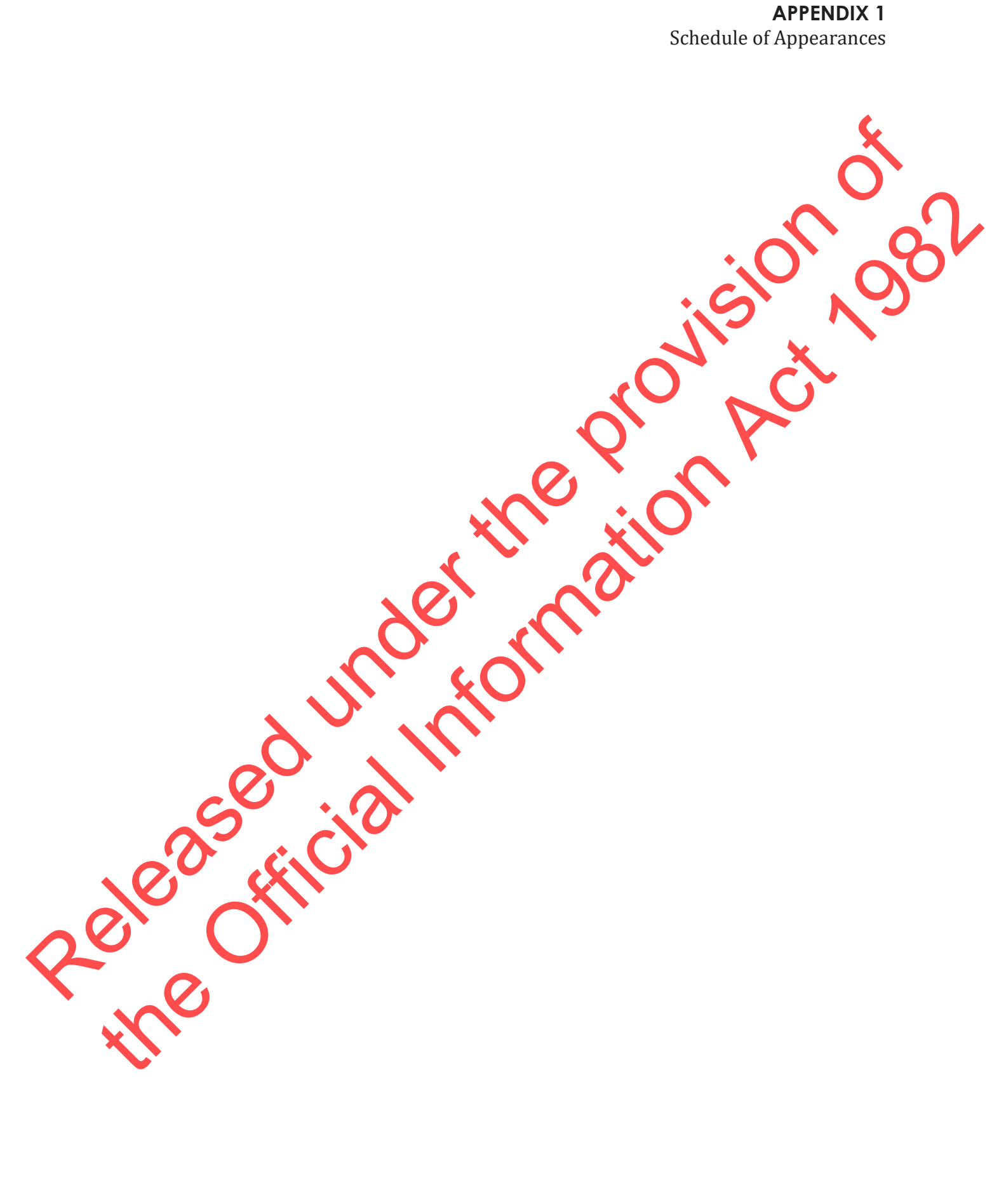
APPENDIX 1 Schedule of Appearances