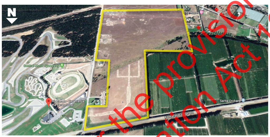
Figure 1: Plan Change site (yellow outline) and locality. Not to scale.

2.1 The site is located on the southwest corner of the State Highway 6 / Sandflat Road intersection, approximately 1km west of the Cromwell urban area. As shown in Figure 1 , It comprises 50ha of pastoral land on two flat terraces, separated by a sloping 10m-high escarpment.