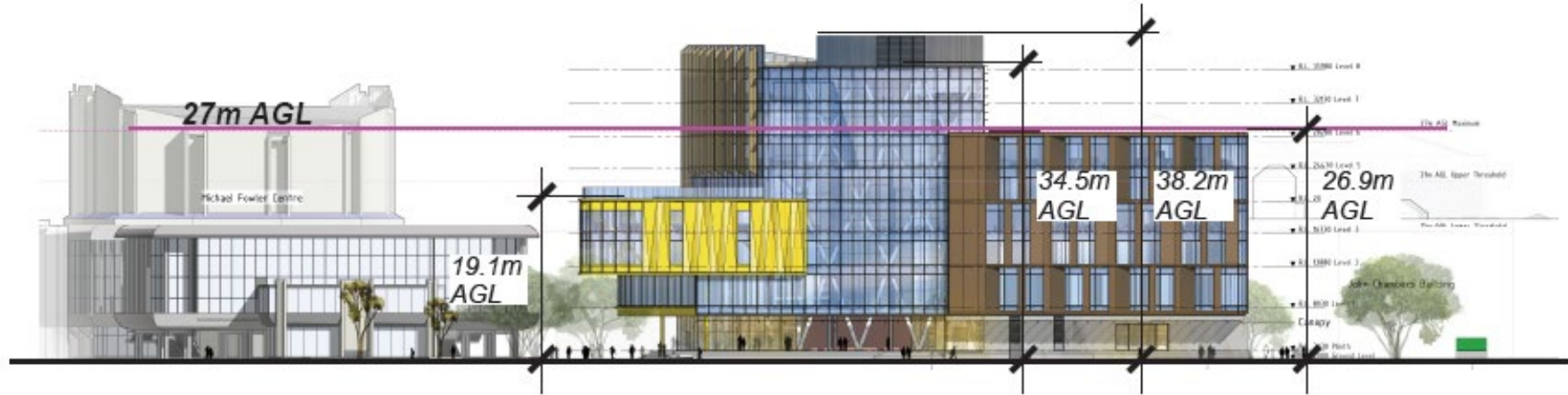
Fig 59. South Elevation Height Diagram