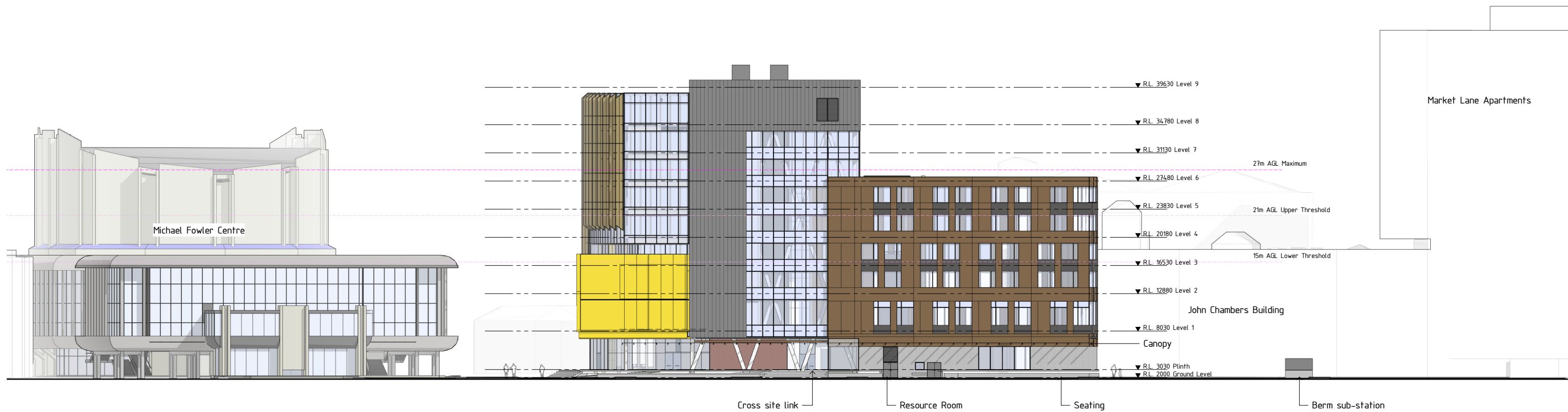
RC - South Elevation 1: 250 A1; 1: 500 @ A3

CLIENT: Willis Bond STRUCTURAL ENGINEER: Dunning Thornton Consultants SERVICES ENGINEER: Aurecon FIRE ENGINEER: Holmes Fire & Safety