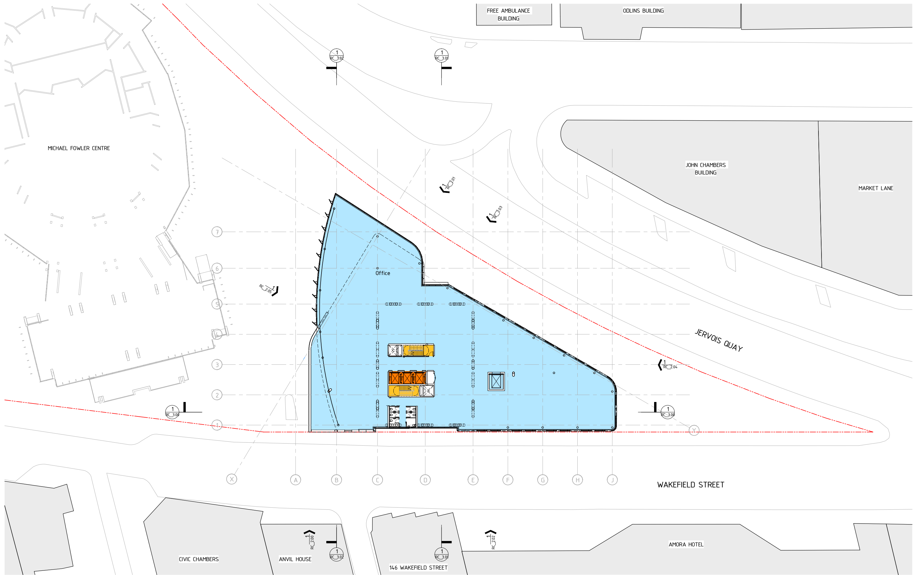
Level 2 Plan 1: 250 A1; 1: 500 @ A3

CLIENT: Willis Bond STRUCTURAL ENGINEER: Dunning Thornton Consultants SERVICES ENGINEER: Aurecon FIRE ENGINEER: Holmes Fire & Safety