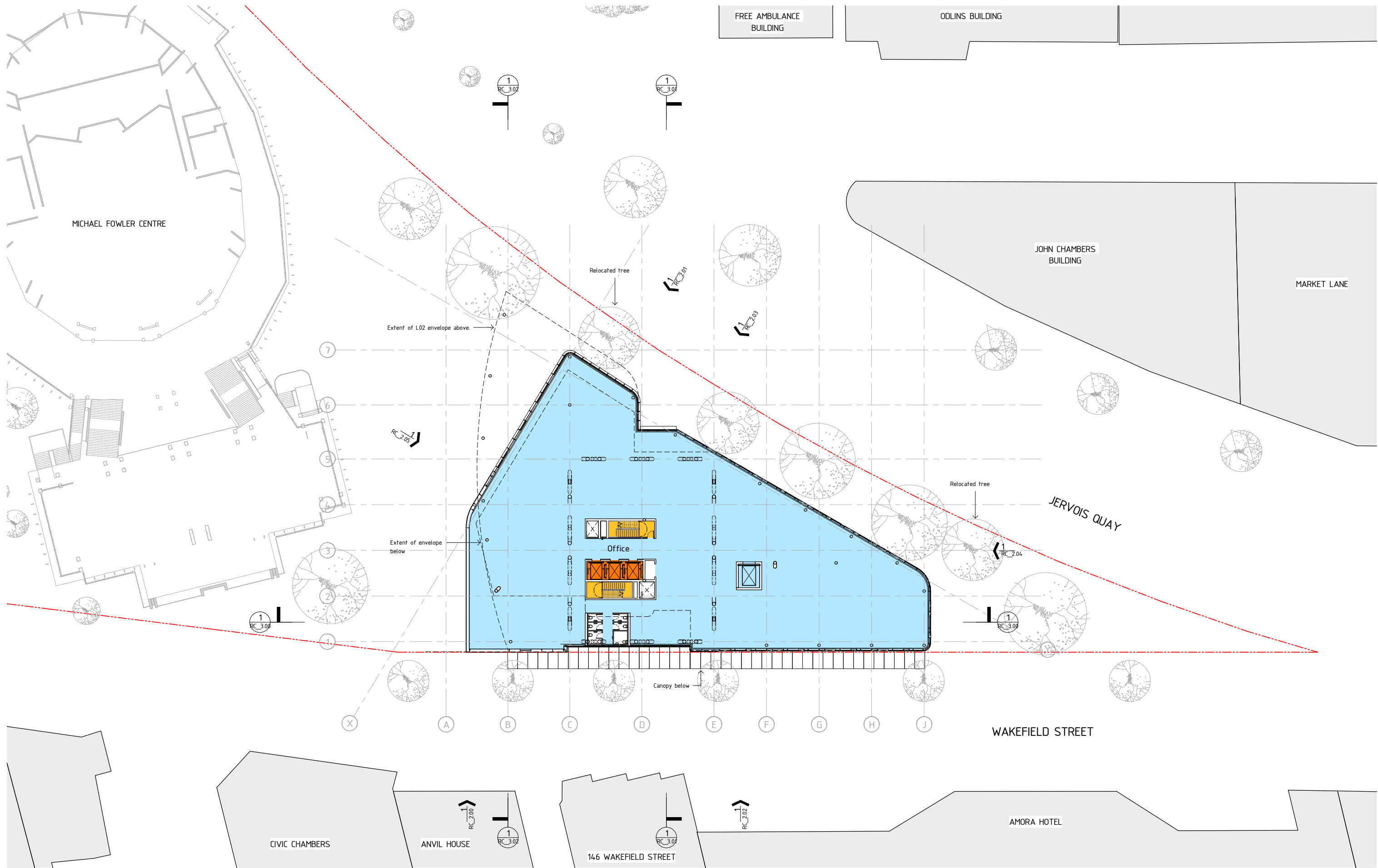
Level 1 Plan 1: 250 A1; 1: 500 @ A3

CLIENT: Willis Bond STRUCTURAL ENGINEER: Dunning Thornton Consultants SERVICES ENGINEER: Aurecon FIRE ENGINEER: Holmes Fire & Safety