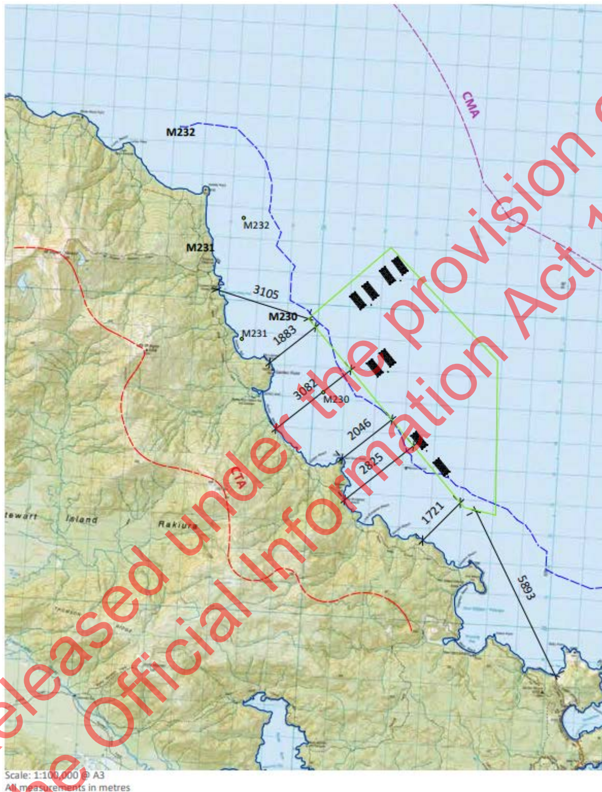
Figure 2: Distances of the proposed site from shore