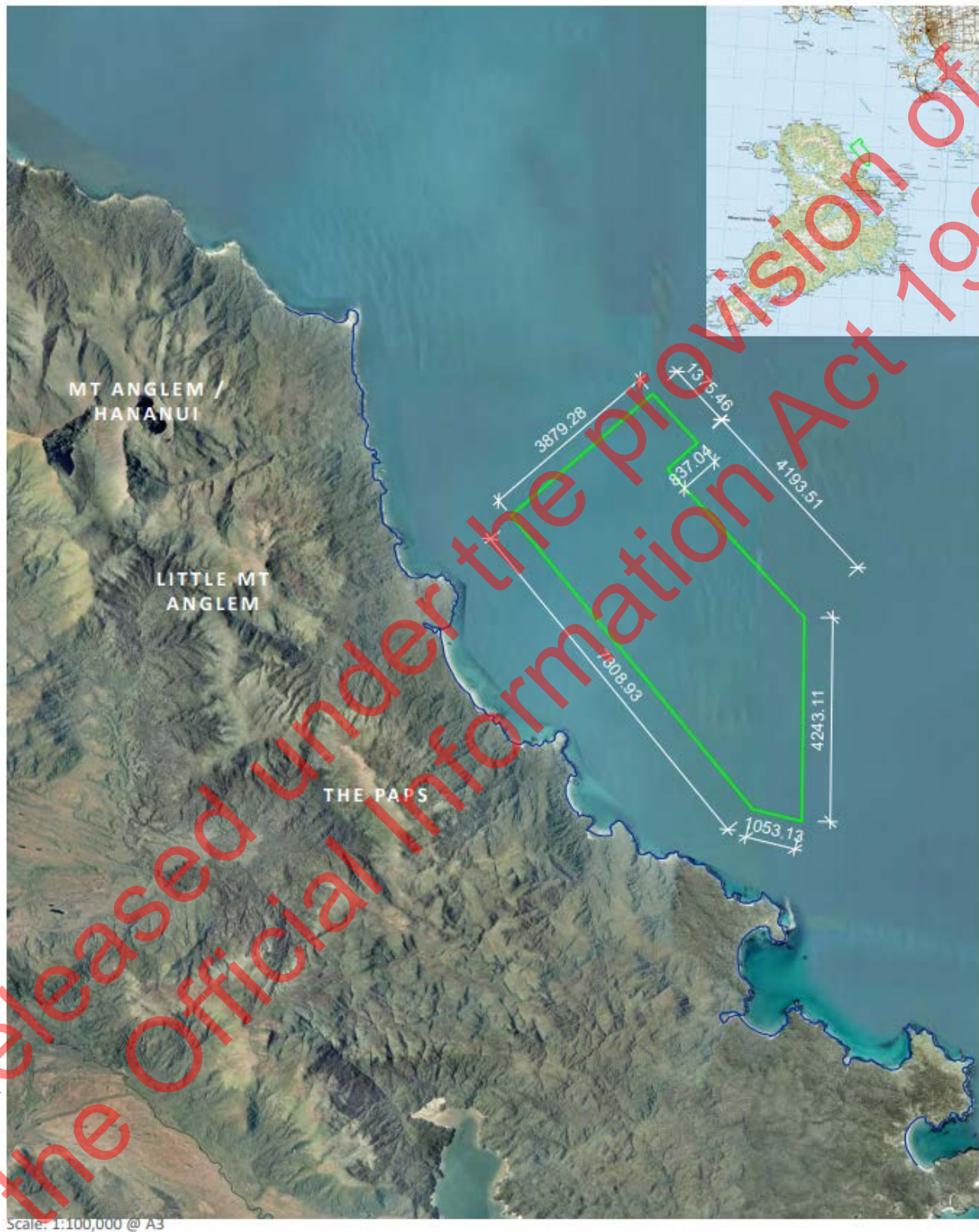
Figure 1: Proposed site location