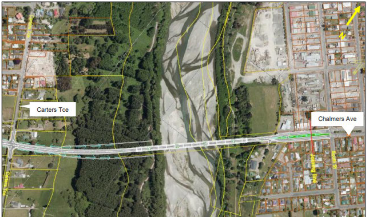
Figure 2: Alignment of proposed bridge.

Snip from GIS showing approximate line of new bridge and approach (red line) and any parcels of land adjacent that are pcl.