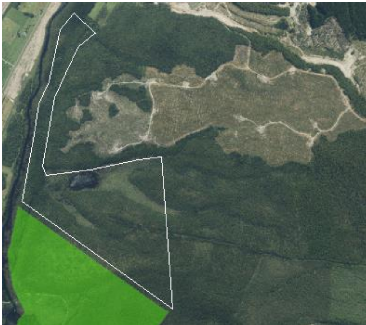
Figure 2b: Approximate extent of iwi land for proposed land exchange outlined white. Green layer represents public conservation land.