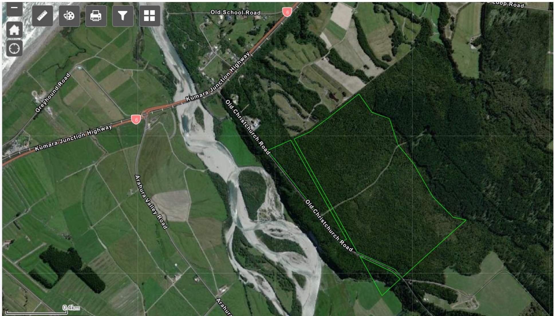
Figure 1: Department of Conservation land proposed for land exchange outlined in green.