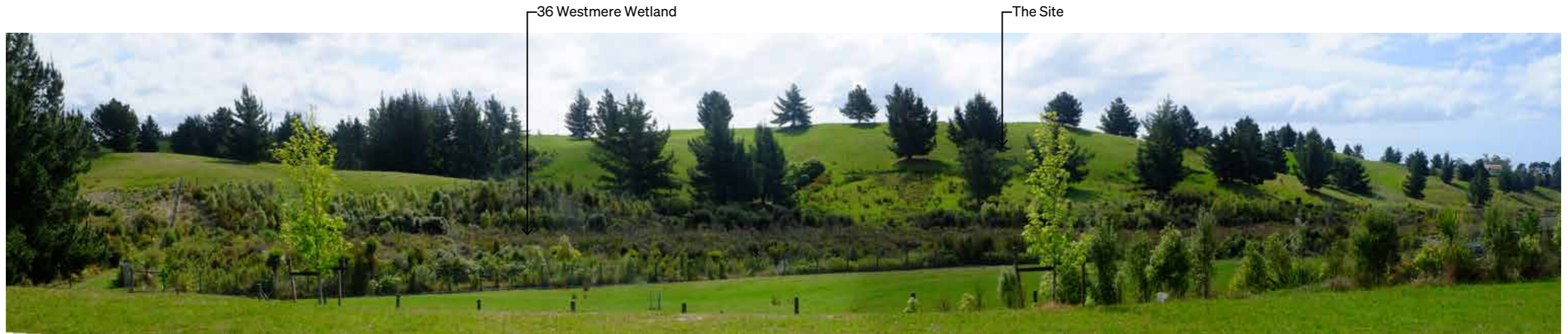
Viewpoint Location Photograph 8: Located on Westmere Drive at the local reserve approximately 125 m from the site, looking west.