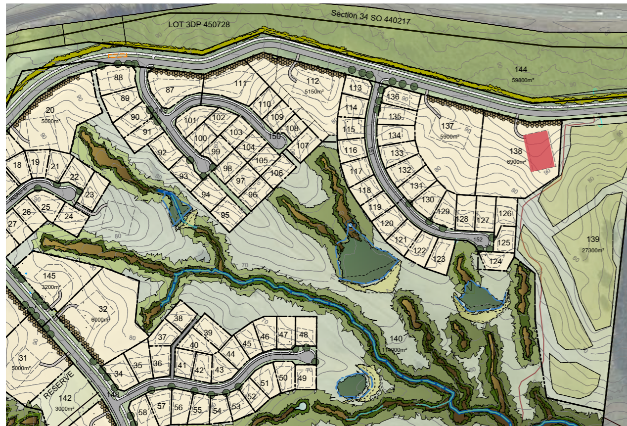
Buildings visible above skyline from Viewpoint 10 = Lot 138.