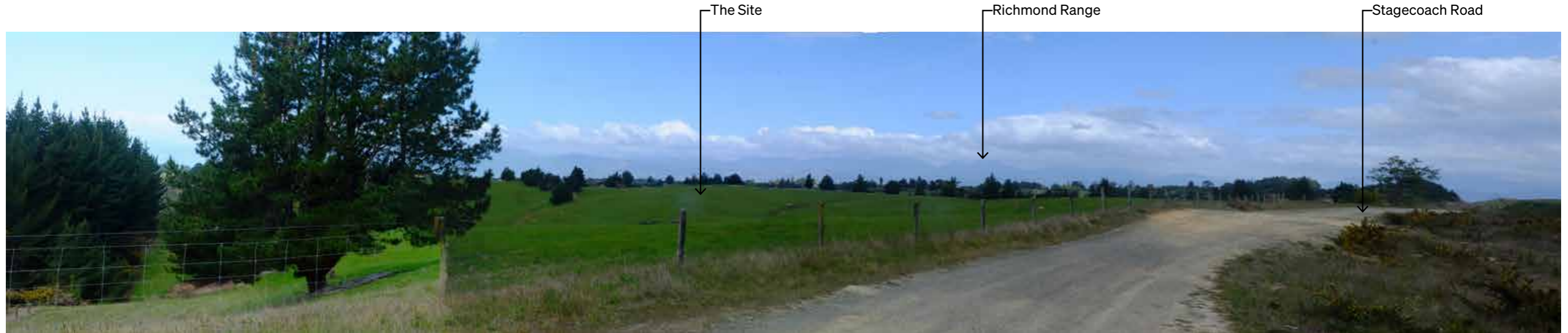
Viewpoint Location Photograph 10: Located on Stagecoach Road at the north-west corner of the site, looking south-east.