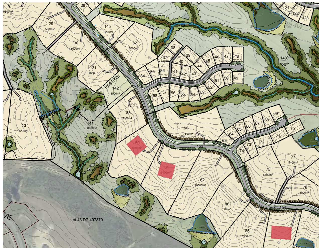
Buildings visible above skyline from Viewpoint 8 = Lots 59, 61, 84.