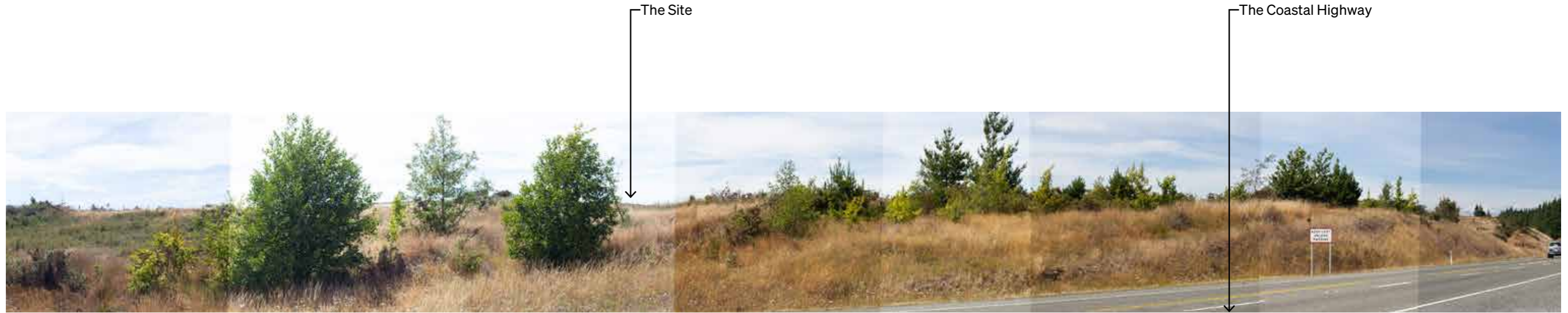
Viewpoint Location Photograph 11: Located on State Highway 60, looking south-east.