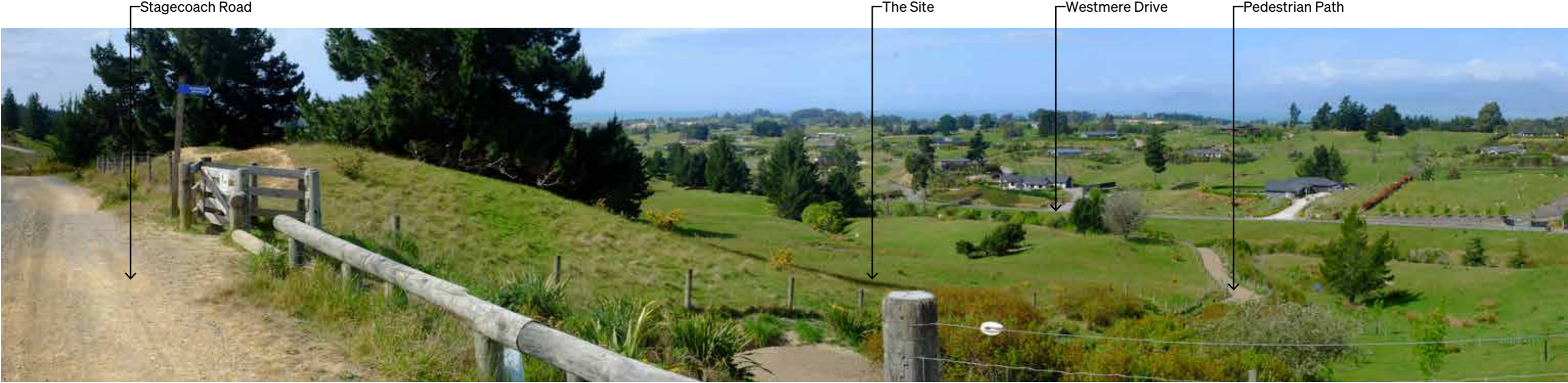
Viewpoint Location Photograph 9: Located on Stagecoach Road at the south-west corner of the site, looking north-east.