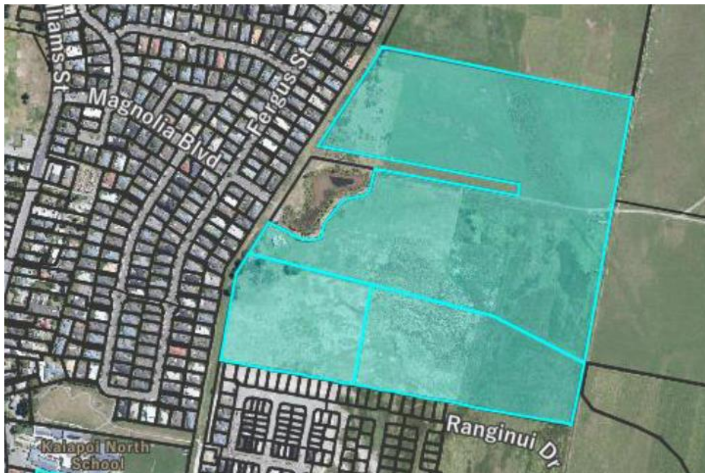
Figure 1: The location of the North Block (marked in blue)