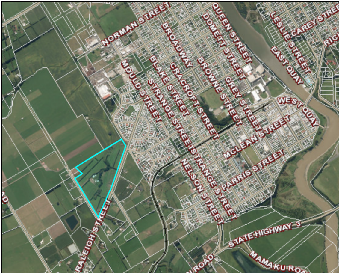
Figure 3. Location map of 2 Johnston Street Brixton, Waitara (TRC GIS Maps, 2018)

The site is located in the intersection of Johnston Street and Raleigh Street with a street address of 2 Johnston Street Brixton, Waitara. The site is less than 1 kilometer from SH3. The subject site is located immediately adjacent to the residential area of Waitara (Figure 2 and Figure 3).