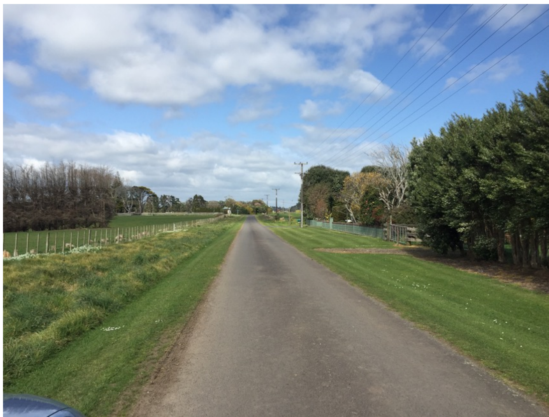
Figure 9. Johnston Street – view from site entrance towards Raleigh Street.

The existing roads are discussed in detail in section 4 of the ITA in Appendix F .