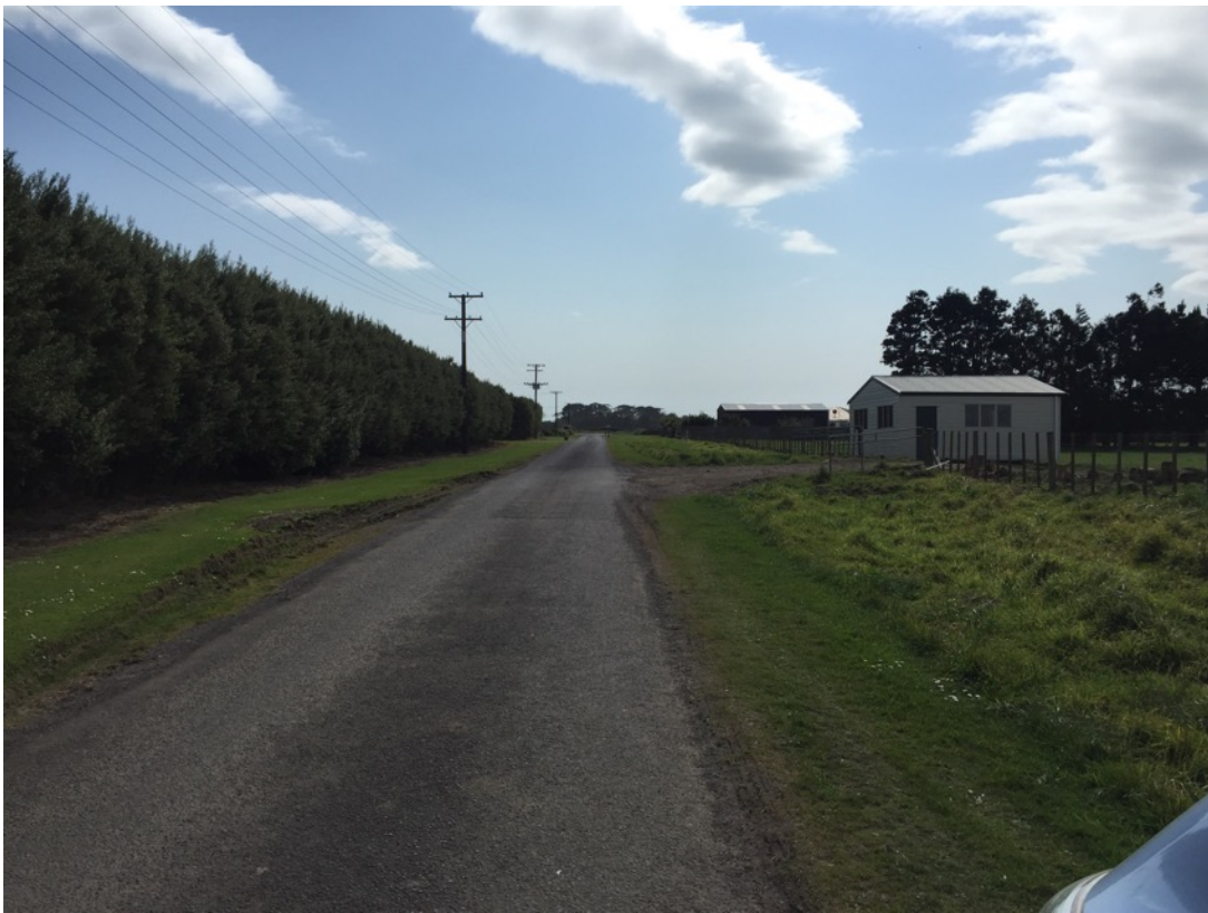
Figure 10. Johnston Street – View from entrance towards the west (end of road)