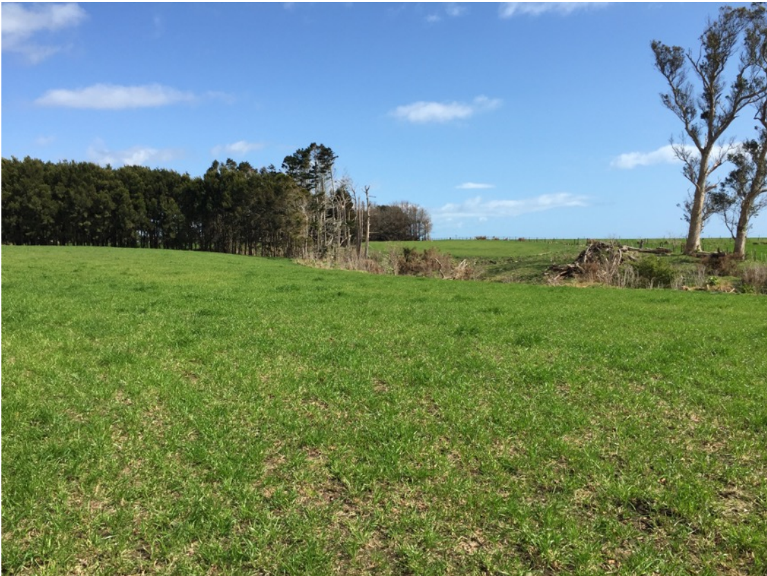
Figure 6. View of site – from northern corner looking across stream.