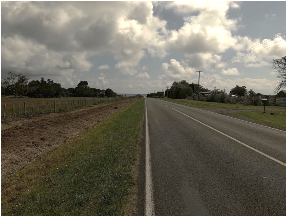
Figure 12. Raleigh Street – looking from Johnston Street Intersection to the North-West