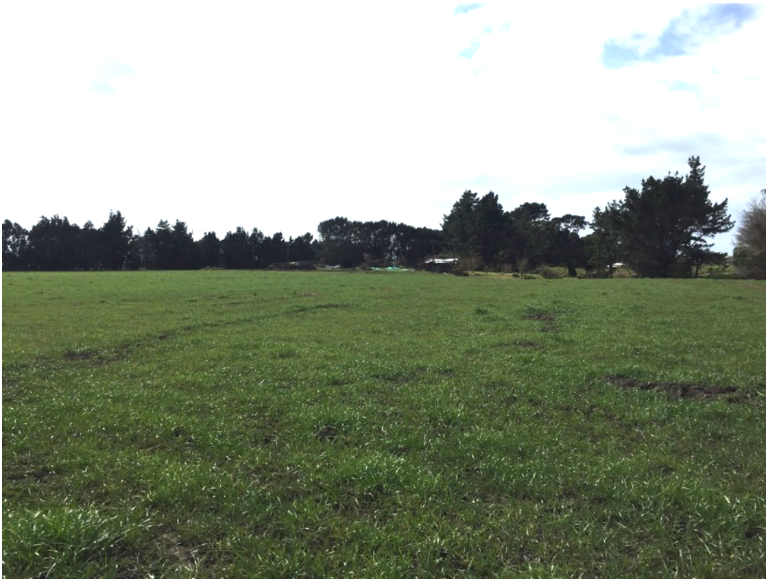
Figure 7. View across site towards the north.