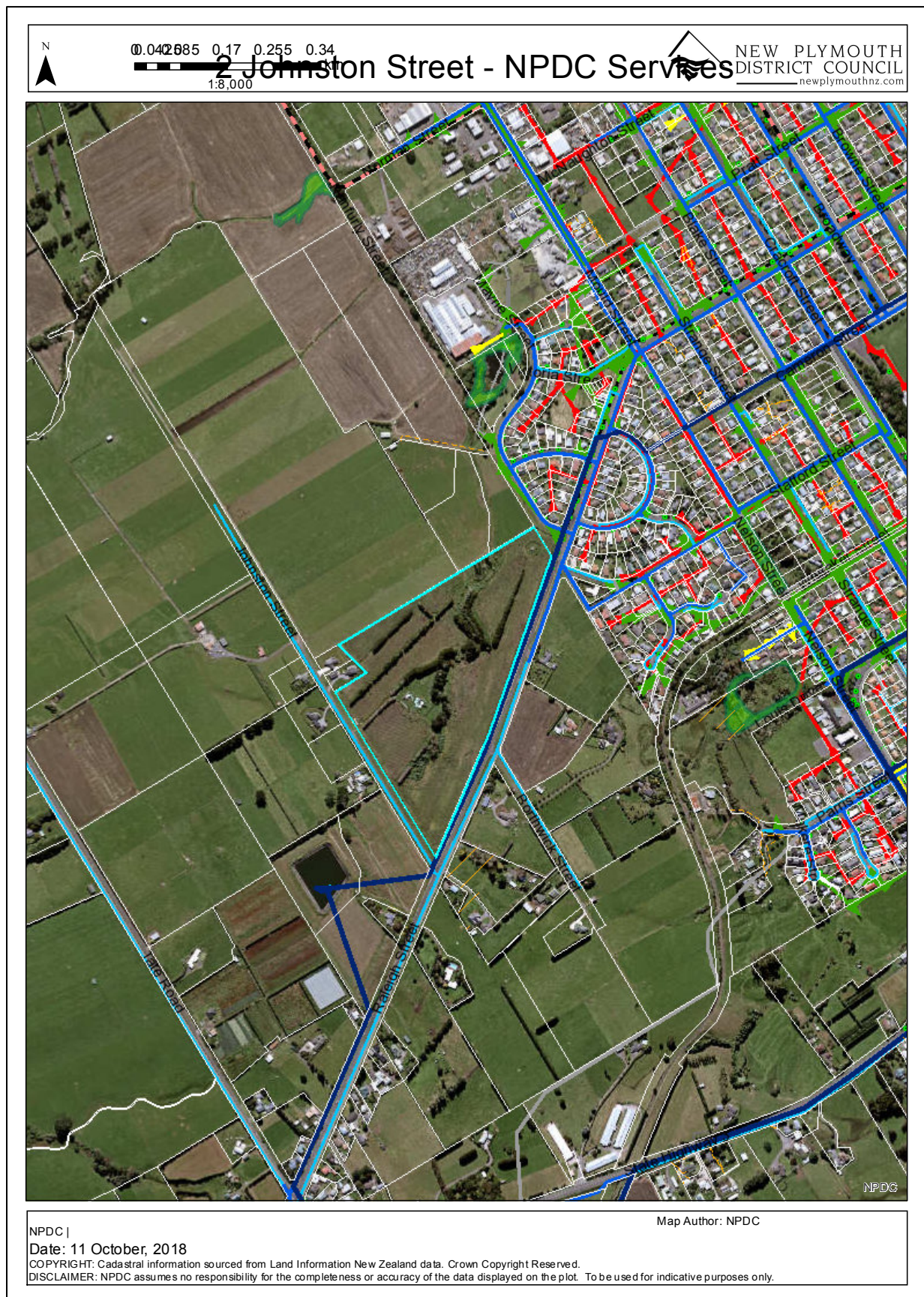
Figure 8. NPDC Services