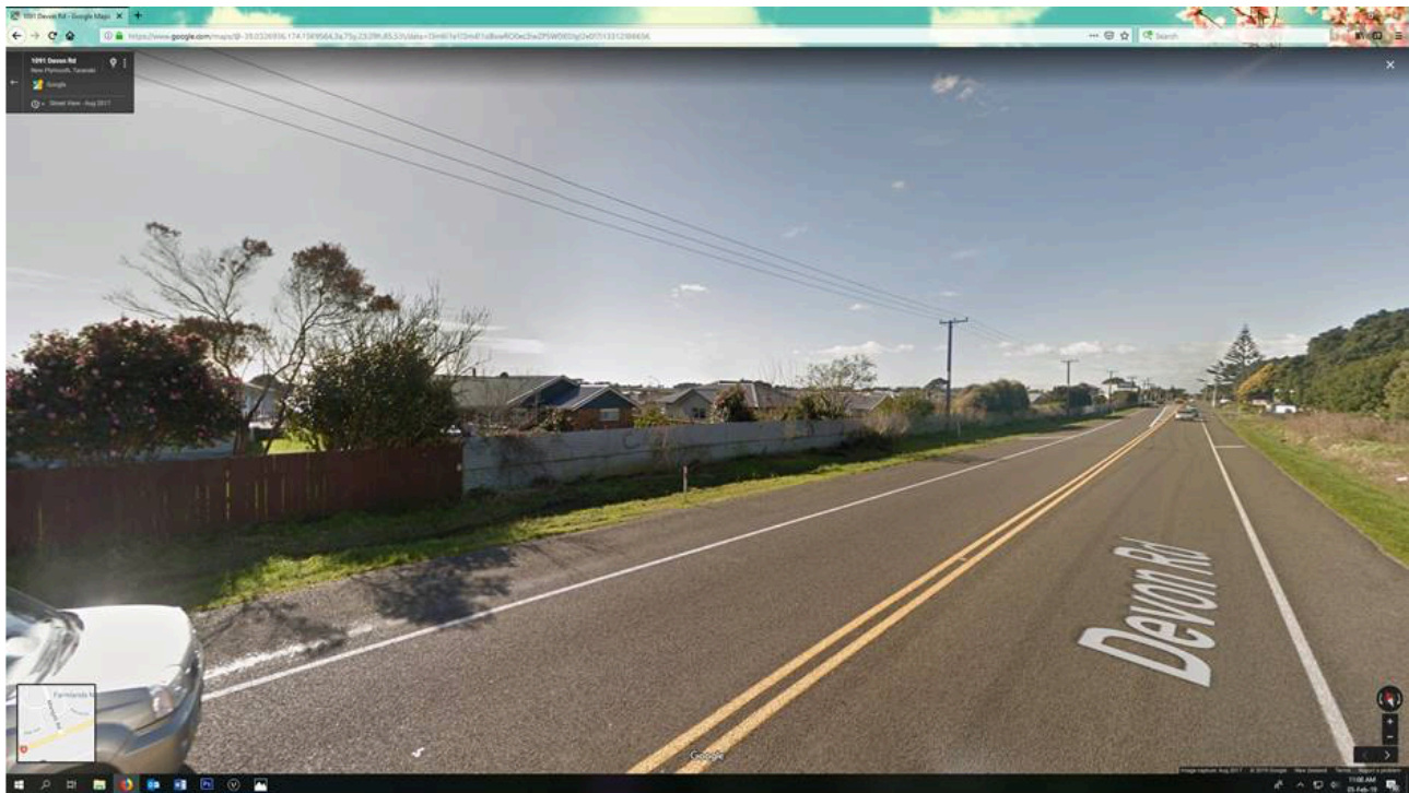
Figure 17. Streetview image of Devon Road – where houses ‘back’ onto the highway.

A screenshot of the streetview images for Devon Road adjacent to bell Block is provided below (Figure 17) for context. While required for practical reasons in this instance (the houses backing onto a highway and highway frontage being undesirable), there does not seem to be the same practical need for such an approach on Raleigh Street.