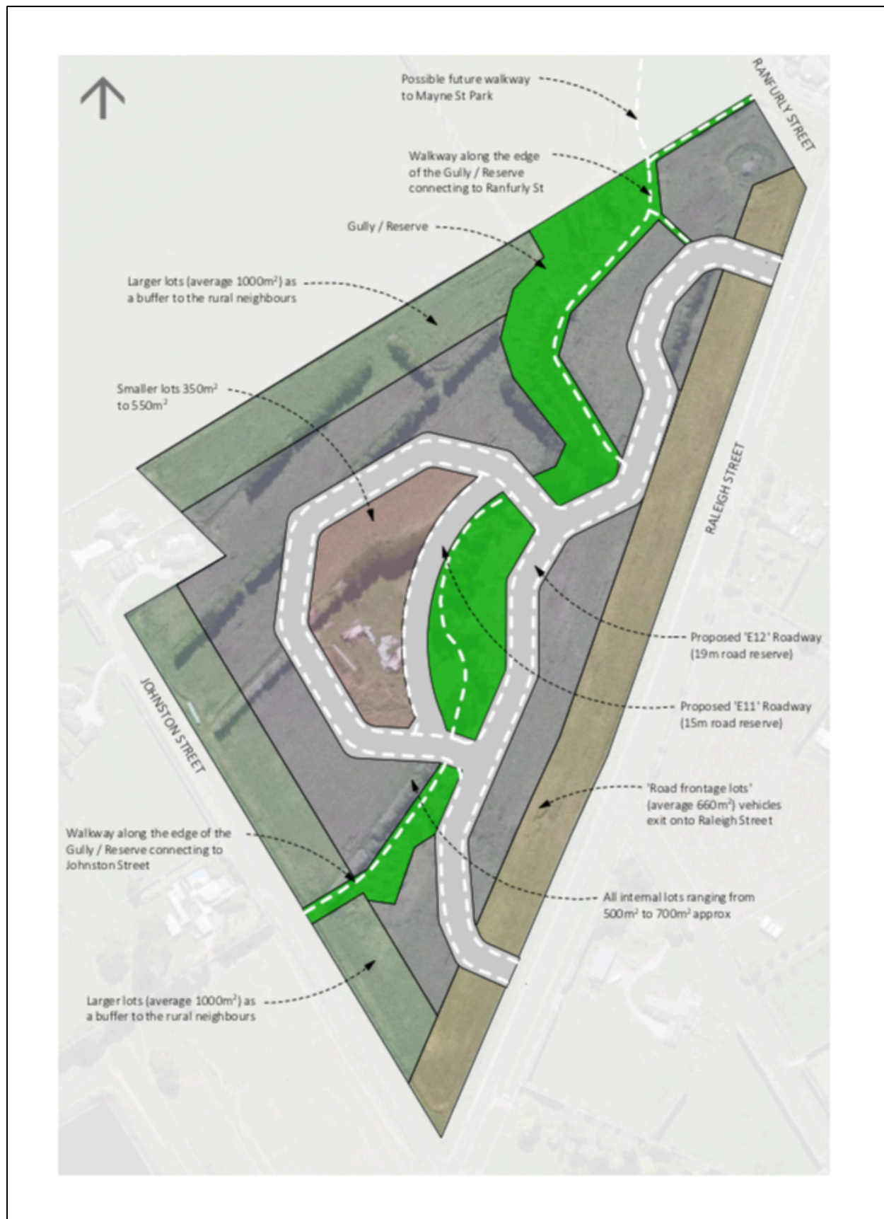
Figure 1. Structure Plan, 2 Johnston Street