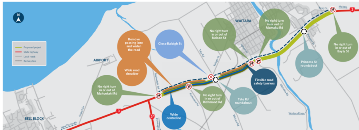
Figure 14. Consultation information on proposed changes to SH3 between Waitara and SH3A

NZTA proposals to upgrade SH3 are shown in Figure 14 and will see Raleigh St become and even more important access into Waitara. A copy of the latest report on the proposed SH3 upgrade, and a summary of community feedback NZTA received is included as Appendix J. On 21 November 2018, NZTA announced that funding has been approved and the upgrades will proceed. Final plans and designs for the works will be available in early-mid 2019.