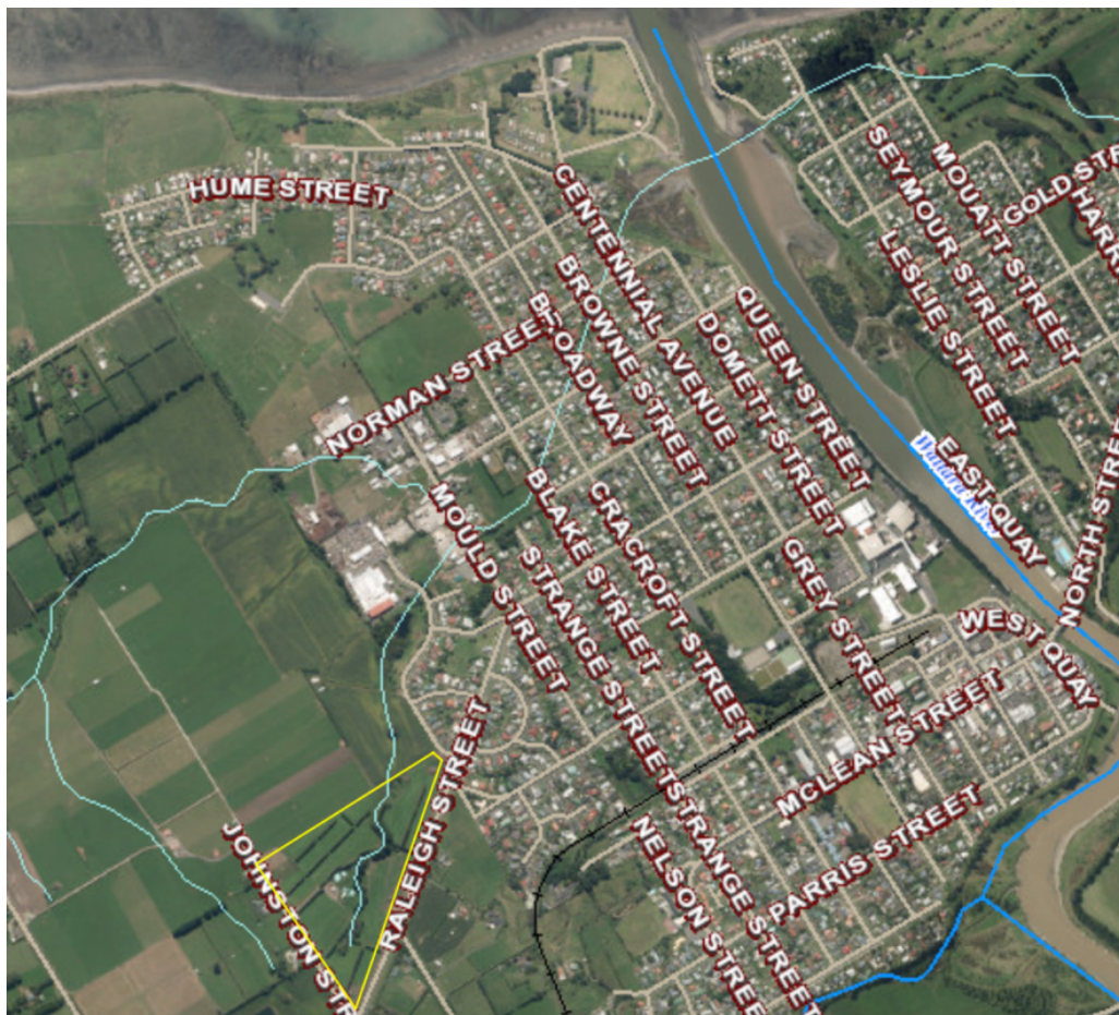
Figure 15. Site (yellow outline) in relation to waterways.

The natural features and site topography is visible in the photos in Figure 4 to Figure 7.