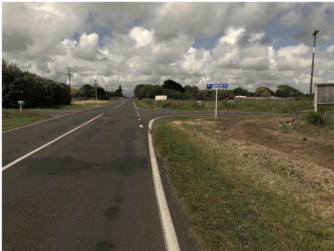
Figure 11. Intersection of Johnston Street and Raleigh Street