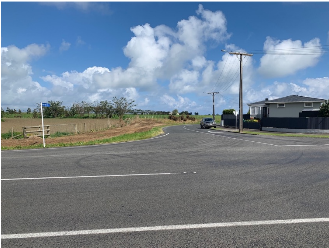
Figure 13. Intersection of Raleigh Street and Ranfurly Street