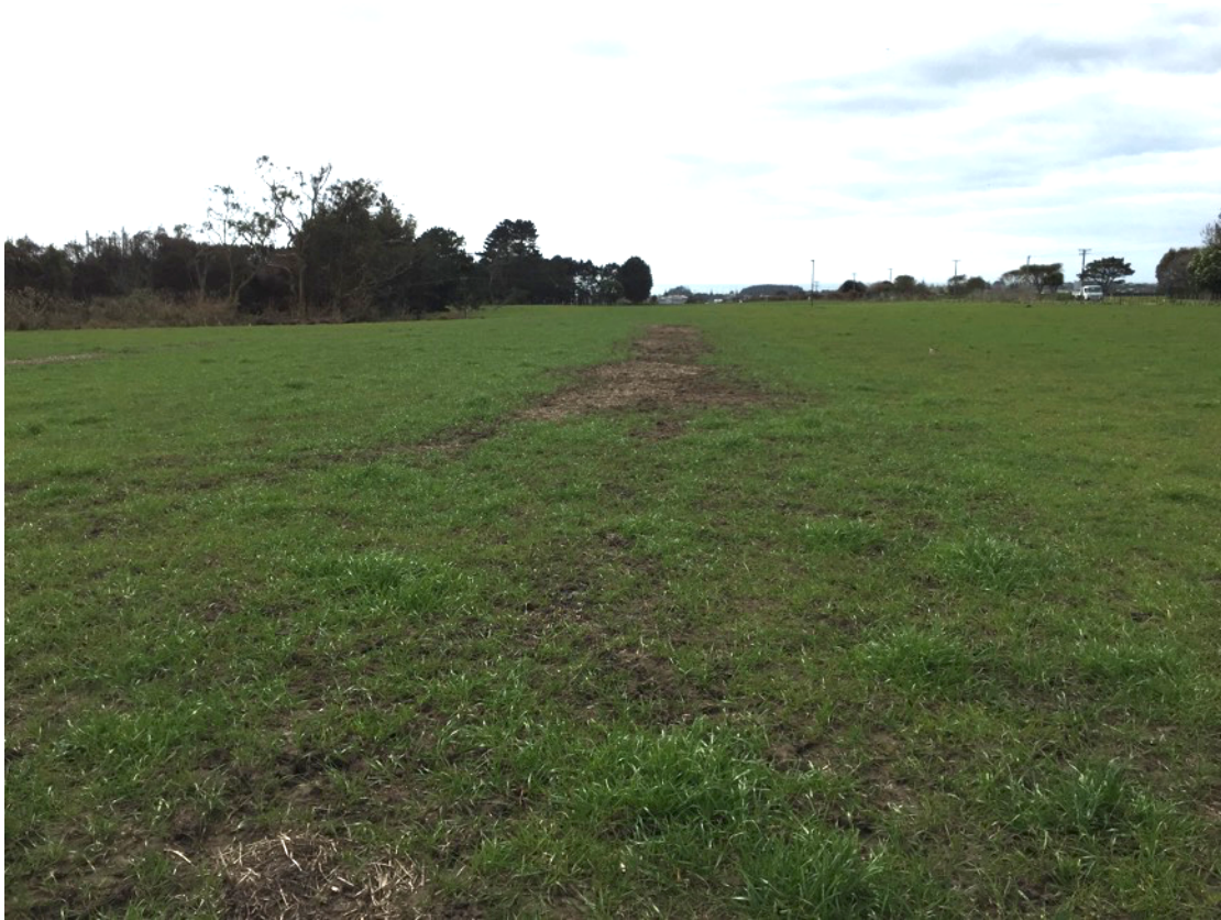
Figure 5. View of site , inside Raleigh Street Boundary. (Raleigh Street to right)