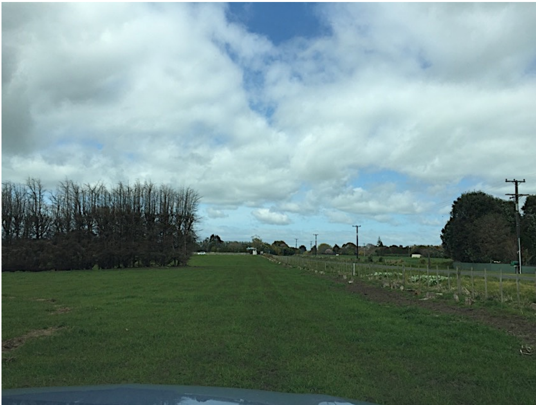
Figure 4. View of site , inside Johnston Street Boundary. (Johnston Street to right)

No special or notable values in the surrounding environment have been identified, however the elevated location of the site, its proximity to entrance corridors, and its position within a stormwater catchment that allows stormwater management in Waitara make it appealing for development.