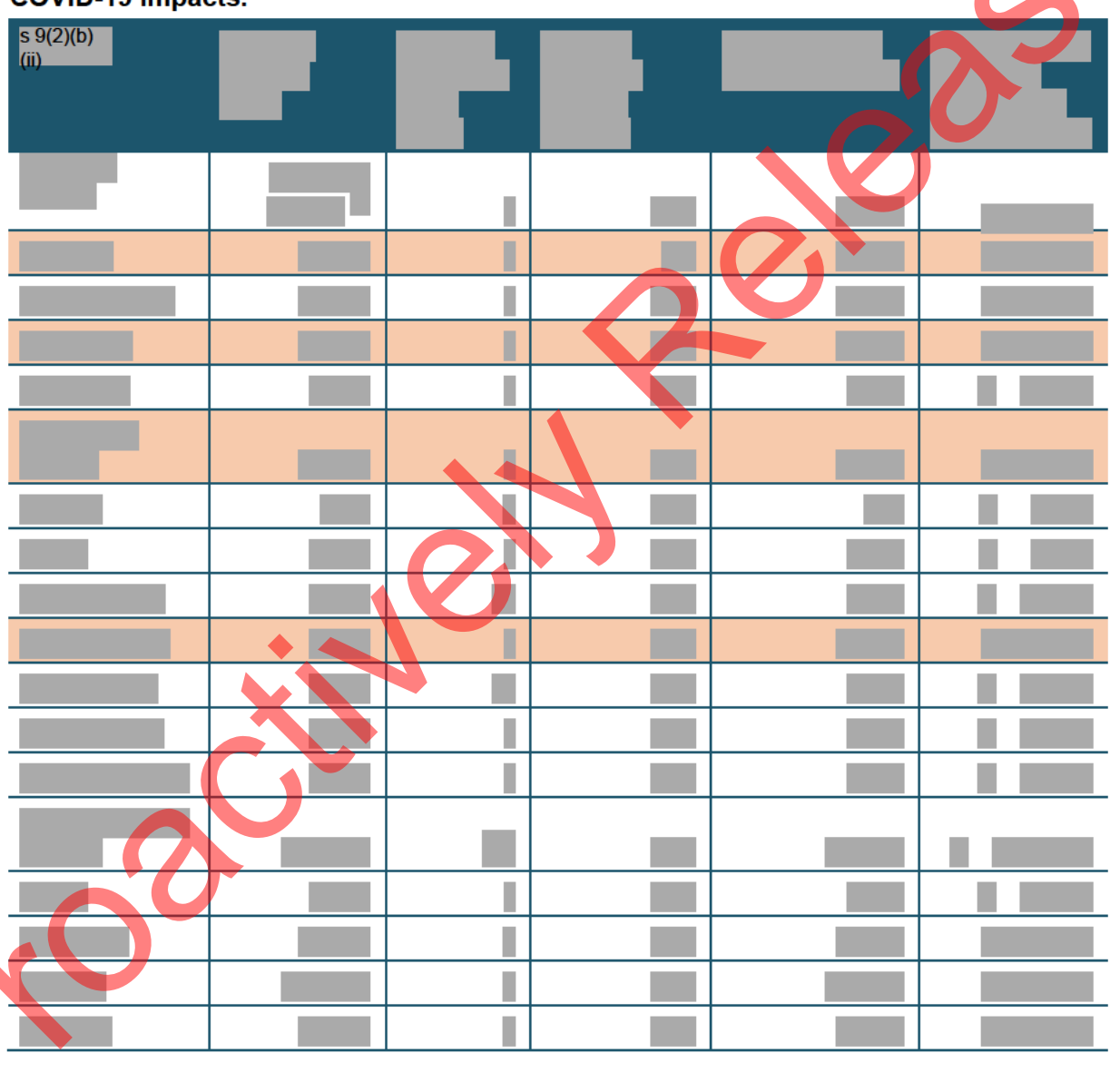
Table 9: Estimates of financial impacts of updating allocative baselines - 2019 data used as reference as production during 2020 was reduced for some activities due to COVID-19 impacts.