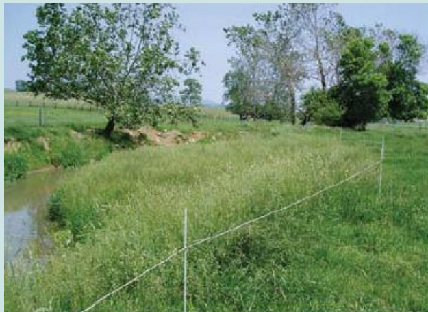
Riparian buffer and stock exclusion fencing on Muddy Creek.

BMP implementation began in the early 2000s. By 2003, the area of Muddy Creek used for drinking water no longer breached the drinking water standard, and the trend continued. In 2010, the stretch of river was removed from the list of impaired waters for nitrate-nitrogen impairment. The watershed remains impaired for aquatic life due to reduced dissolved oxygen levels.