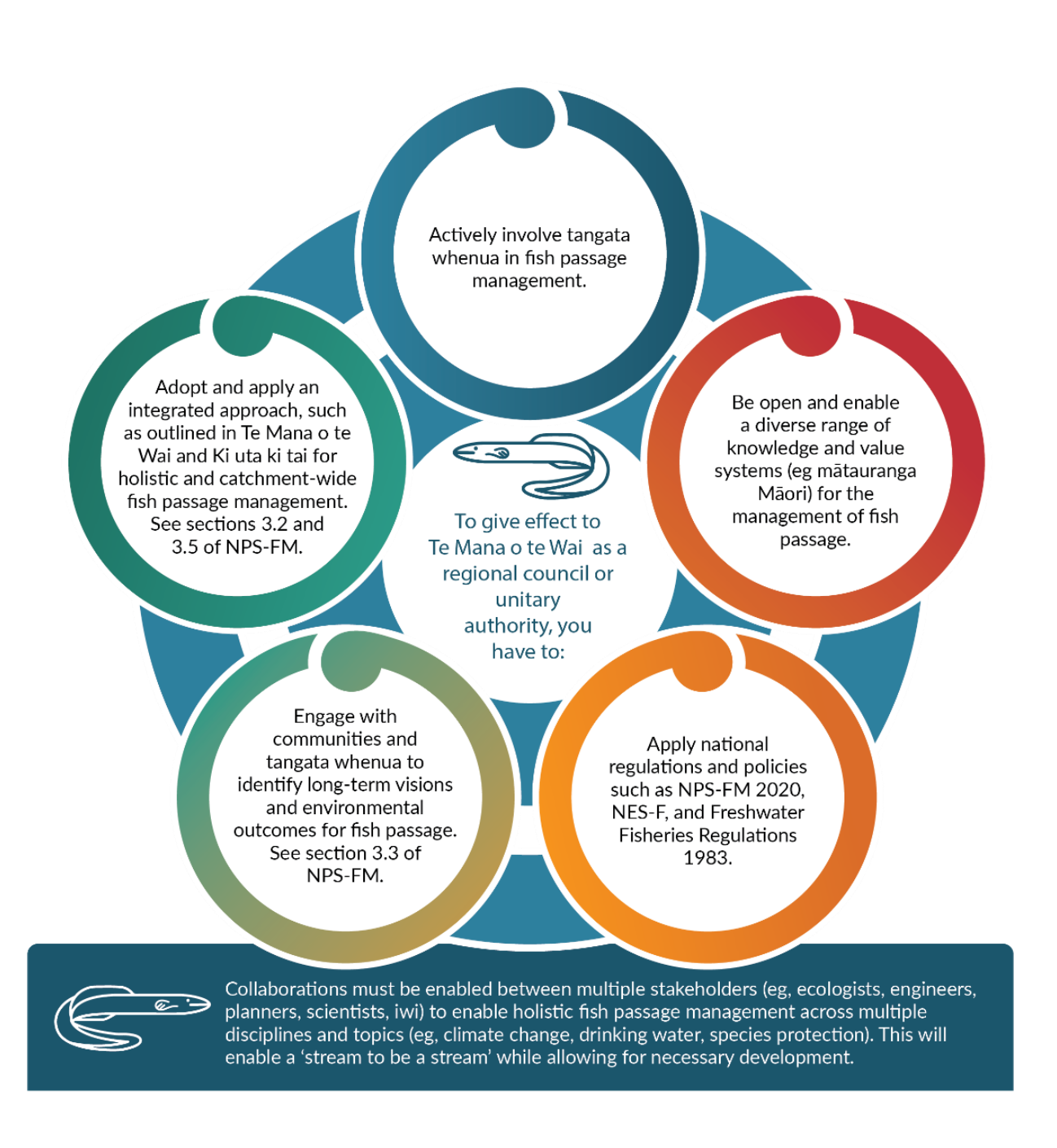
Figure 1: How regional councils must give effect to Te Mana o te Wai as it relates to fish passage

Note: NES-F = National Environmental Standards for Freshwater; NPS-FM = National Policy Statement for Freshwater Management.