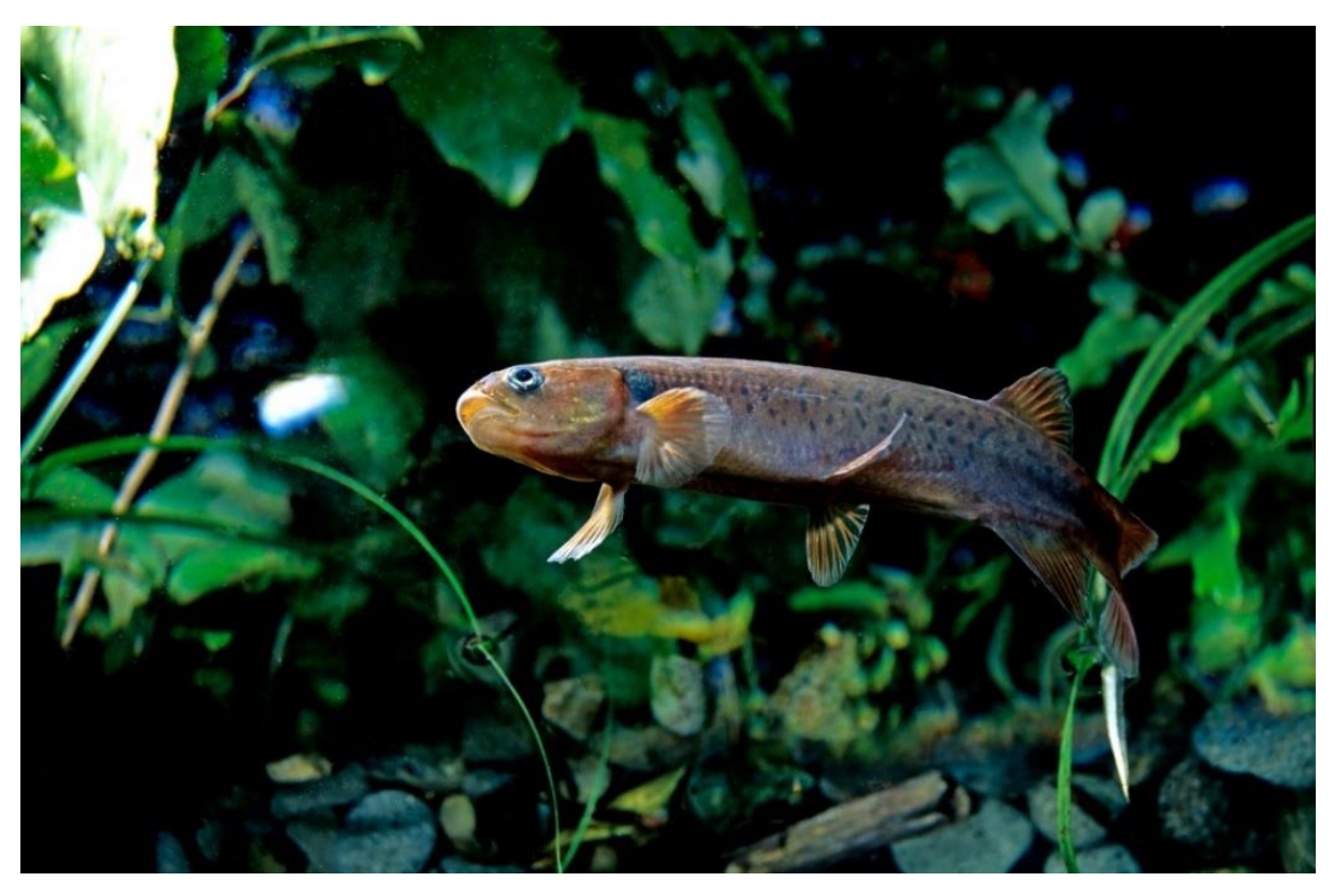
Short jawed kokopu ( Galaxis postvectis ) in deep forest pool, Taranaki, Aotearoa New Zealand.

The NPS-FM 2020 (in clause 3.26, below) makes a number of directions to regional councils in relation to fish passage for inclusion in their regional plans. As regional plans are progressively updated to address the requirements under the NPS-FM 2020, the policy position of each regional council will become further supportive of maintaining or improving fish passage.