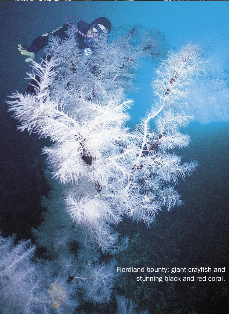
Fiordland bounty: giant crayfish and stunning black and red coral.

“It’s no different from any other industry. It’s a finite resource so you can only take so much, and when you take too much you’re going to pay for it.”