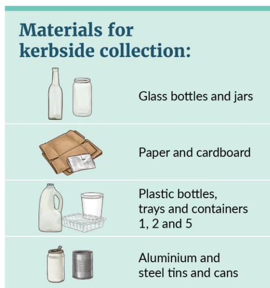
Figure 1: Standard materials list for household kerbside recycling

The materials included are able to be processed and sorted effectively, are unlikely to contaminate recycling or affect health and safety, have strong and sustainable end markets, and support a circular economy (that is, by being able to be recycled multiple times). Table 1 provides further details on the standard set of materials.