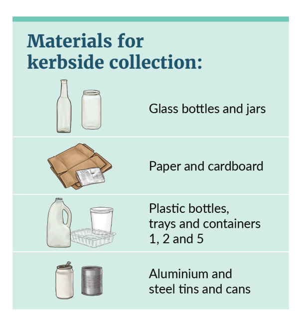
Figure 1: Standard materials list for household kerbside recycling

The materials included are able to be processed and sorted effectively, are unlikely to contaminate recycling or affect health and safety, have strong and sustainable end markets, and support a circular economy (that is, by being able to be recycled multiple times). Table 1 provides further details on the standard set of materials.