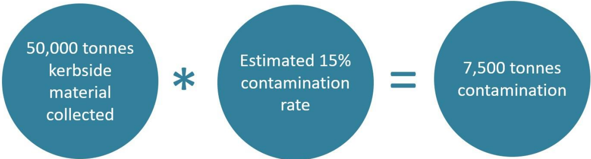
Figure 2: Example of how to calculate kerbside contamination tonnage under options 2a and 2b

After conducting contamination audits, it is possible to multiply the overall tonnage of kerbside material collected by the estimated contamination percentage, to produce an estimated kerbside contamination tonnage (see figure 2).