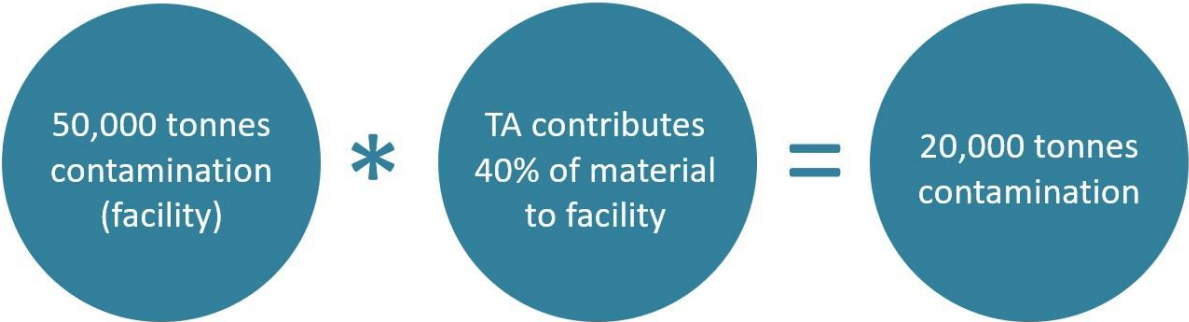
Figure 3: Example of how to calculate kerbside contamination under option 3