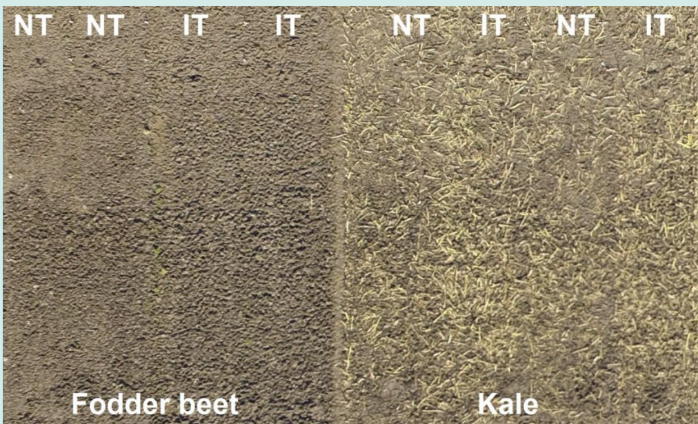
Figure 7: Differences in pugging after a forage crop (fodder beet or kale) was established with no-till (NT) or inversion-till (IT).

Photos show less pugging in the lower yielding kale crop (relative to fodder beet) and less pugging in no-till soils, especially in fodder beet areas.