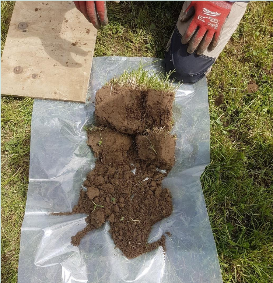
Figure 13: Visual soil assessment in December 2021 of a Brown soil (well-drained) on a dairy farm.

The site was a two-year-old pasture, after winter forage crop grazing. The site had been aerated one year before the assessment. The soil shows large aggregates near the surface, with many smaller, friable aggregates at the deeper depth.