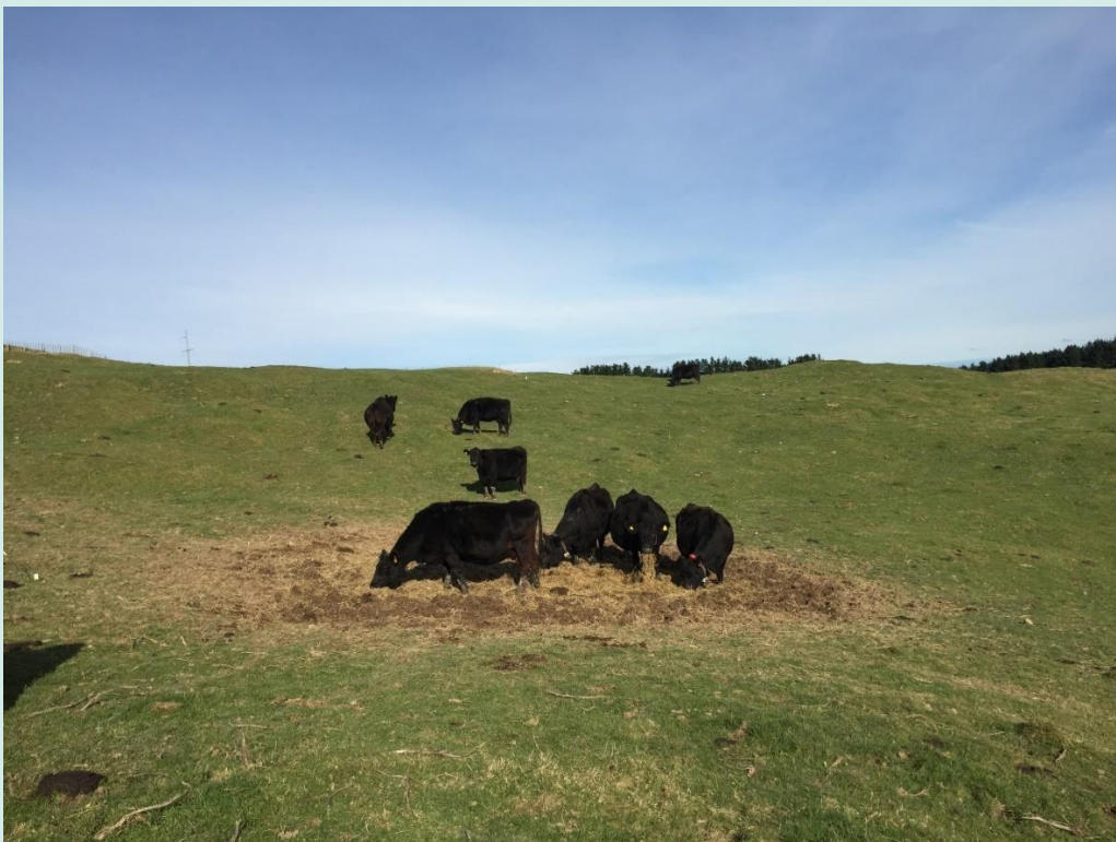
Photo shows the area where supplementary feed was placed on the well-drained soil.