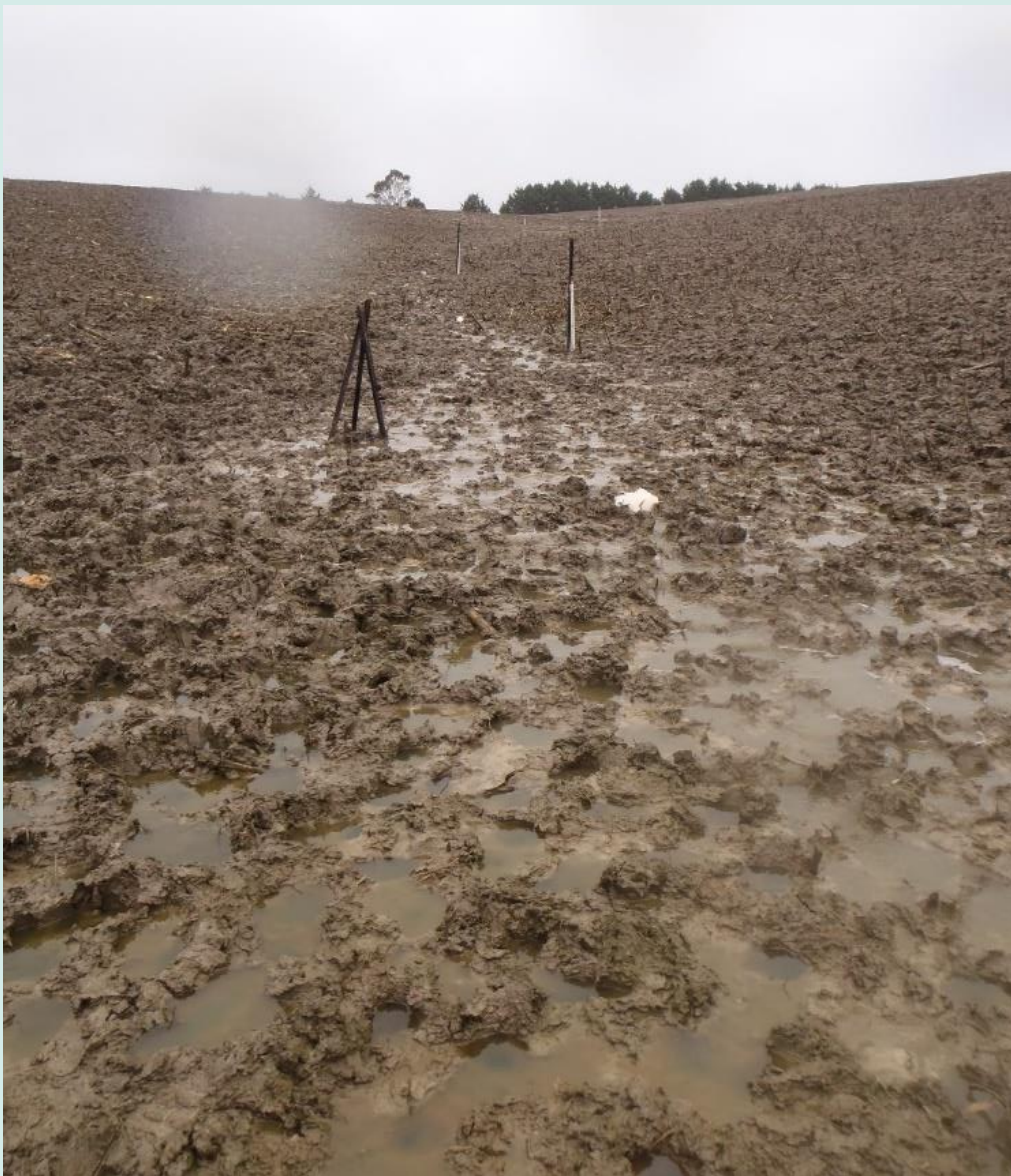
Figure 2: Soil pugging, surface ponding and reduced soil infiltration after IWG of cows on a winter forage crop in South Otago.

This photo was taken before IWG regulations came into effect.