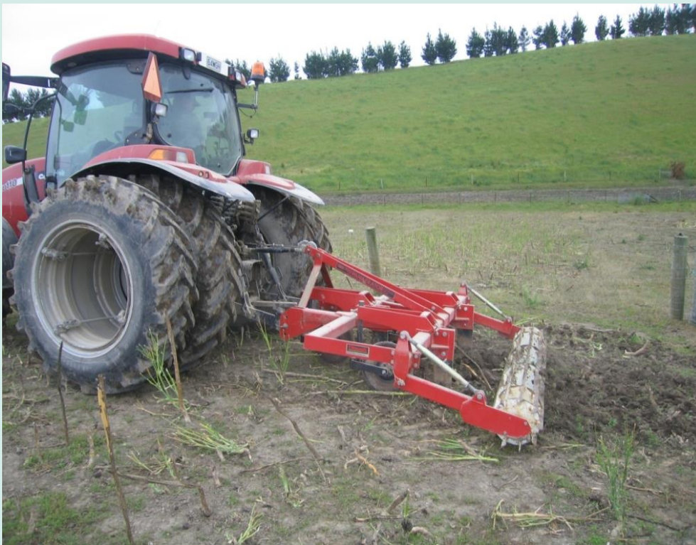
Figure 14: Mechanical soil aeration using a 'Clough pan-aerator' with winged tips for improving soil structure after winter forage crop grazing.

Aeration was carried out at a depth of 20 cm and soil water content of 24 per cent. The winged tips caused the soil to lift and shatter and improved soil porosity.