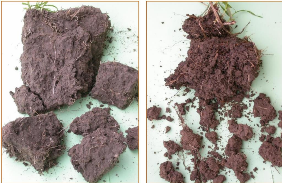
Figure 1: A very compacted pallic soil (left) and a non-compacted pallic soil (right).

The compacted soil has large dense aggregates that are difficult to break apart. The non-compacted soil has smaller more friable aggregates with many visible cracks and pores.