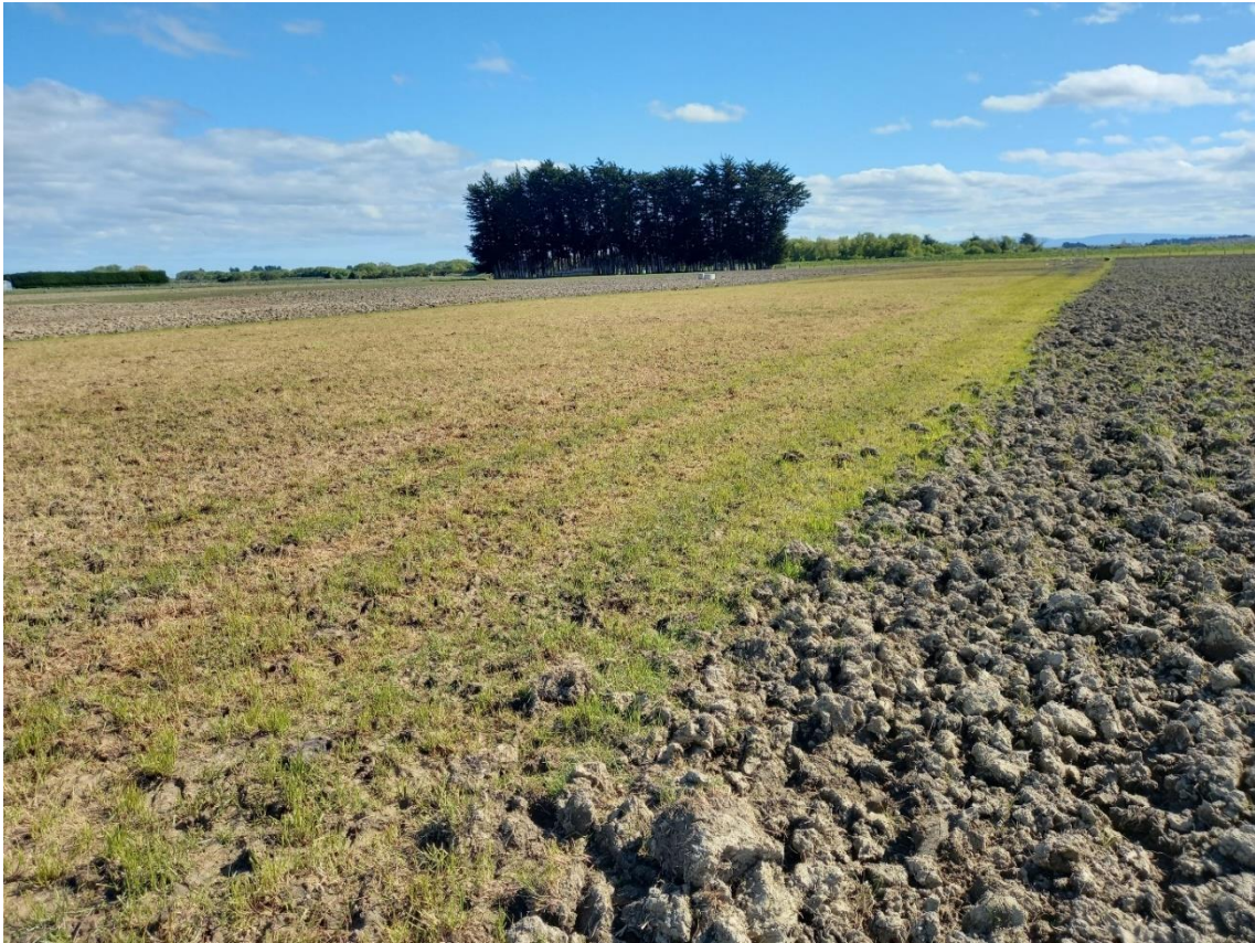
Figure 9: A grass 'break-out' area within a forage crop paddock, Southland, that was used as a 'fresh' area for cows resting in adverse weather conditions.