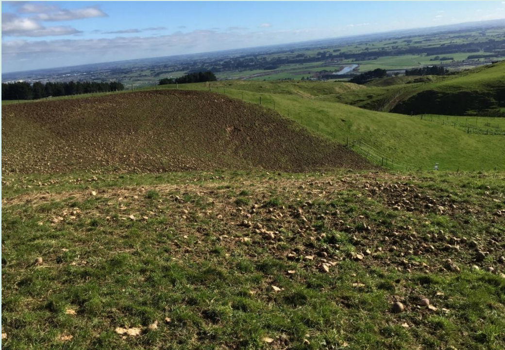
This photo was taken before IWG regulations came into effect.