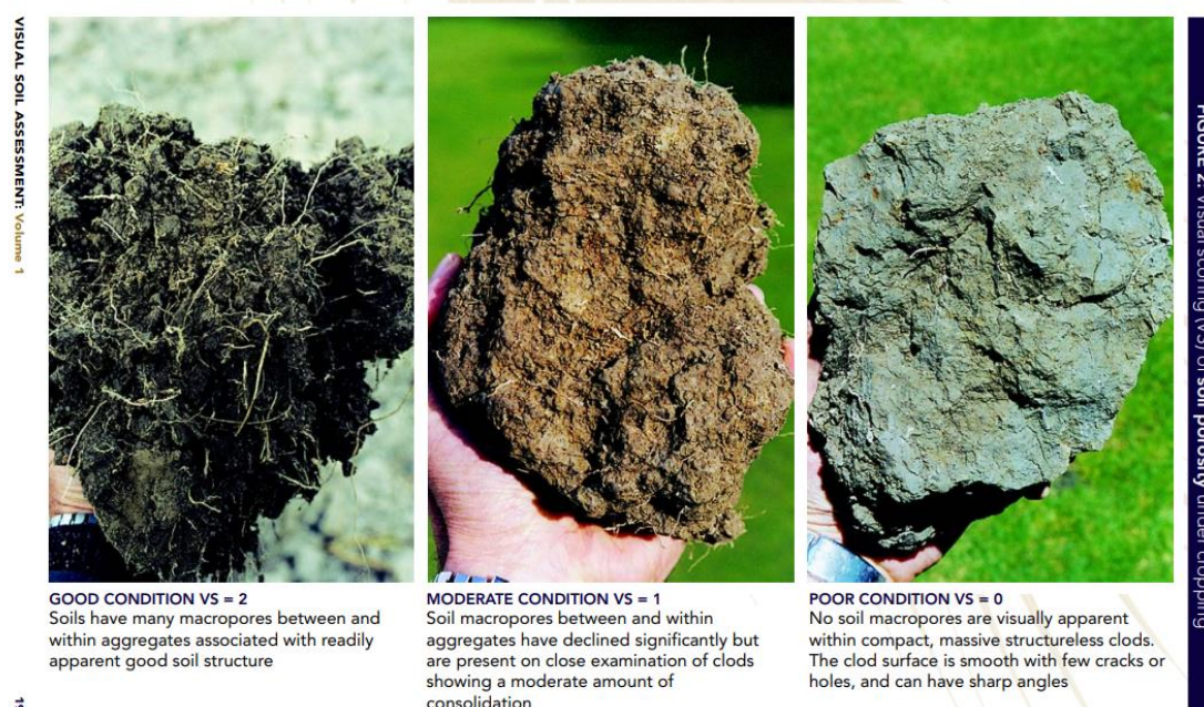
Figure 11: A page from the VSA guide showing good, moderate and poor soil condition.

Visual observation can show good or poor soil structure (see figure 1 and figure 11 ). A visual soil assessment can also be useful for identifying the presence of mottles, an important indicator for soil drainage class.