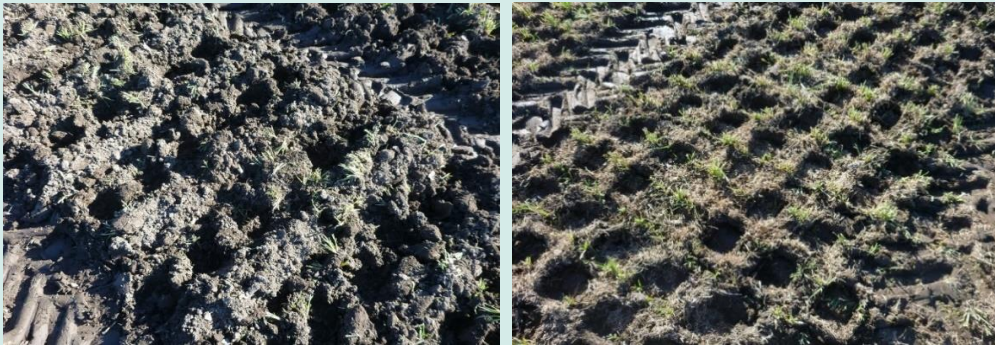
Figure 6: Differences in soil physical damage simulated using a ‘cow treading implement’ to assess mitigation options in forage crops, after oats were established with (left) inversion-till and (right) no-till.

Simulation was undertaken in winter (August) when soil was wet (at field capacity). Photos show the protection to the soil from using no-till (Hu et al, 2018).