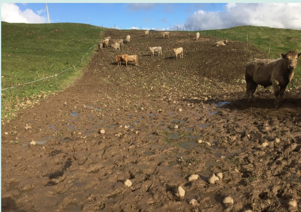
Figure 4: Winter grazing study (Burkitt et al, 2017) on a swede crop in Manawatū, showing pugging on an imperfectly drained soil.

Photo shows greater pugging occurred in the wetter area of the lower slope. Conventional grazing was used – starting at the bottom of the slope. No back-fence was used. This photo was taken before IWG regulations came into effect.