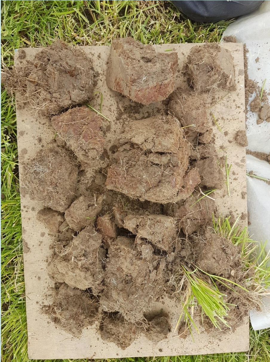
Figure 12: Visual soil assessment in December 2021 of a pallic soil (imperfectly drained) on a dairy farm.

The site was a one-year-old pasture (sown October 2020), after two years of winter forage crop grazing. The soil shows large dense aggregates and mottling on aggregate surfaces (indicating compaction).