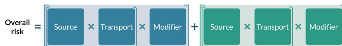
Figure 3: Overall block risk calculation

The overall risk is calculated as the sum of the products of the baseline risk, multiplied by the modifiers (figure 2).