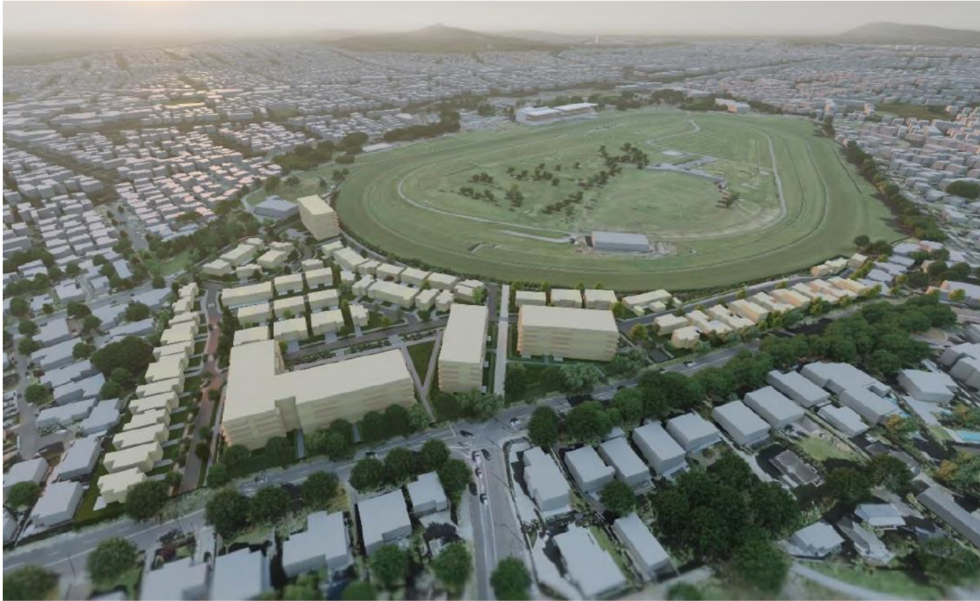
View looking southwest towards Maungakiekie / One Tree Hill; (Maungawhau / Mt Eden is at far right)