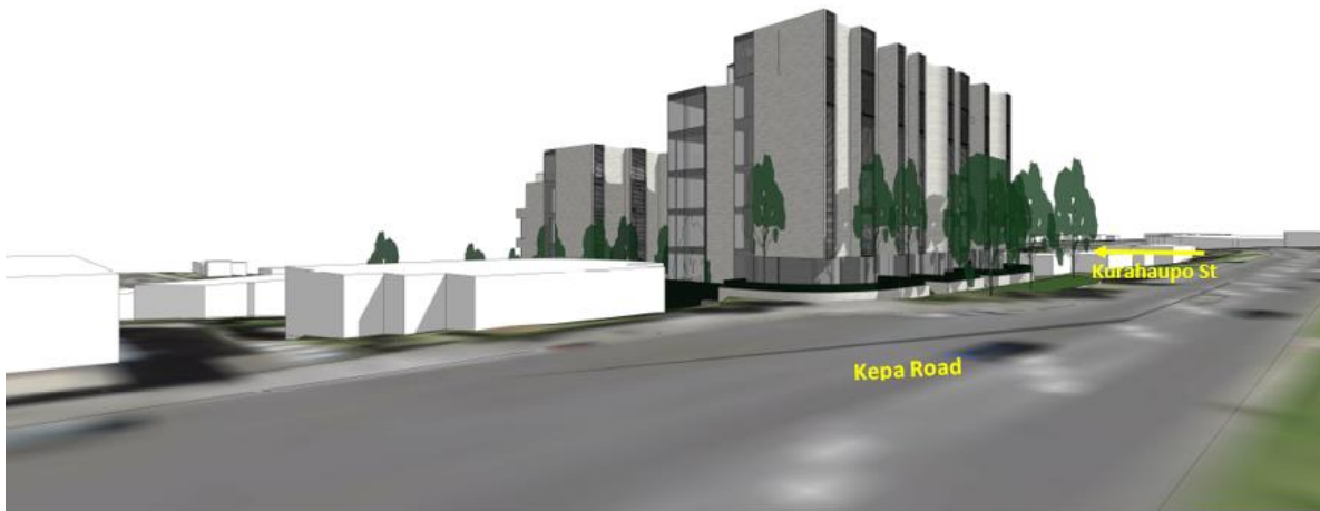
View from Kepa Rd looking north-east