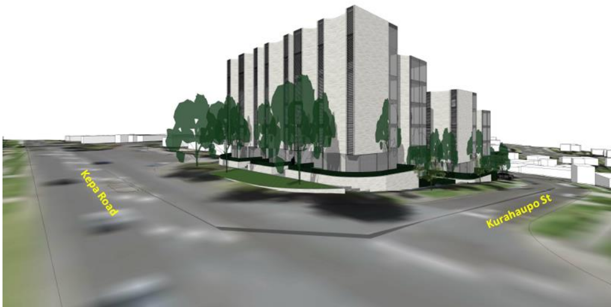
View from corner of Kepa Rd and Kurahaupo St, looking north-west