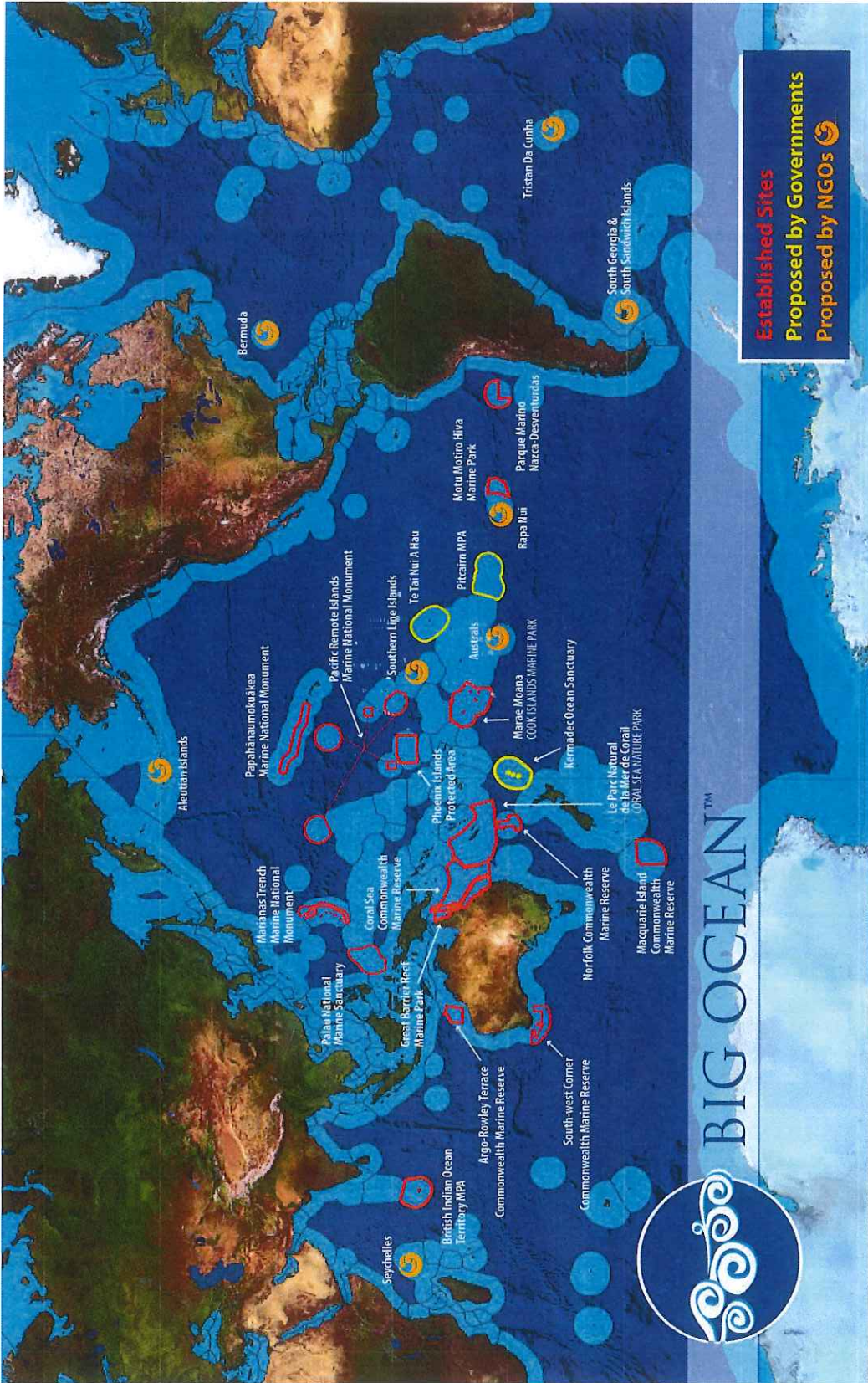
Appendix One: Map existing and proposed marine protected areas