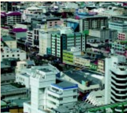
Density – Higher densities found in town or city centres like central Wellington provide exceptional access to office and retail employment.

The East Hills Development near Napier is an example of a rural cluster development that, while still car-dependent, nevertheless provides an alternative to large lot rural/residential subdivision. Relatively small house sites are placed strategically across the 76 hectare site to maintain privacy, benefit from views and blend in with the natural landscape. The balance of the land is designated as reserve, to be owned and managed by an owners' association. An extensive planting programme protects the local environment and enhances habitats. Logan, 2004