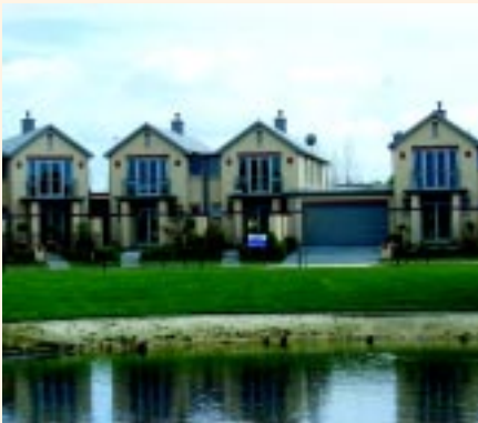
Density – Northwood residential area in Christchurch offers a choice of housing types, including medium density terraced housing.

High urban density can be beneficial for public health because it encourages more walking and cycling. High density can also make public transport – which involves more walking than private vehicle use – more viable.