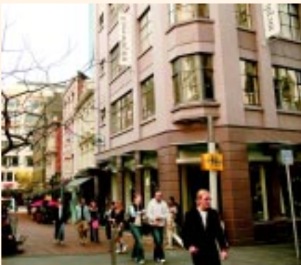
Mixed use – A mix of retail outlets, cafes, bars and professional offices attracts people to Vulcan Lane in Auckland at all times of the day and night.

The 2001 CABE and DETR research, which involved numerous case studies, concluded that “mixing uses leads directly to higher user and occupier satisfaction and was fundamental to the social, economic and environmental value added by the most successful case studies”. Carmona et al, 2001