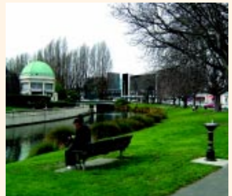
High quality public realm – The Avon River and surrounding areas provide an attractive setting for a variety of recreational pursuits.

Danish urban designer Jan Gehl says that while people will do only what they need to in poor quality public spaces, an additional "wide range of optional activities" will occur in high quality spaces "because place and situation now invite people to stop, sit, eat, play and so on". Gehl, 2001