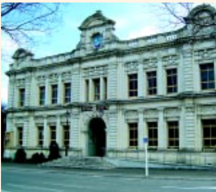
Local character – Oamaru has many unique historical buildings created from the local creamy white ‘Oamaru Stone’.

According to David Thorns, “at the local level the preservation of difference has become valued, sometimes as a commodity to sell, through the rediscovery of heritage sites and conservation and the recreation of the past”.