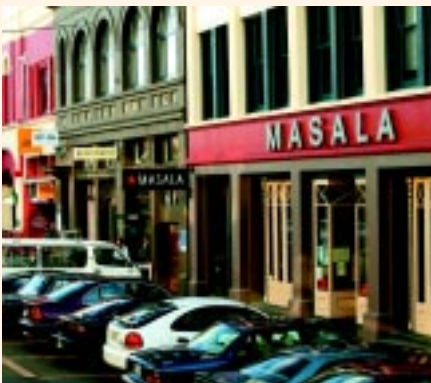
High quality public realm –Blair and Allen streets in Wellington were transformed from a redundant industrial and market area into an attractive area to work in, or walk through.

The only potential negative effect of improving the public realm is the social impact that occurs when people or businesses can no longer afford to remain in an area that has been redeveloped or ‘gentrified’. However, studies suggest that – providing these possible social problems are also addressed – gentrification can be positive for a city and its residents.