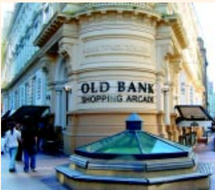
Adaptability – The former BNZ buildings restored and converted into the Old Bank Shopping Arcade in Wellington.

Case studies of high quality urban design projects by the Property Council of Australia in 1999 included as one of seven assessment criteria “the ability to change over time”.