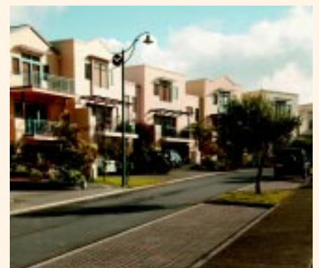
Integrated decision-making – The Harbour View development in Auckland incorporating quality urban design and providing value gains for the developer and residents.

Ministry for the Environment, 2005, and other sources