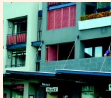
Mixed use – This mixed use development on Parnell Road in Auckland combines apartment living with shops at ground level.

Expert observations of the centres of major US cities point to a link between intensive mixed use and increased safety. Petersen, 1998