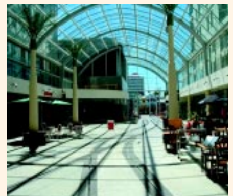
Connectivity – The Christchurch tram route runs through Cathedral Junction and is a popular tourist attraction.