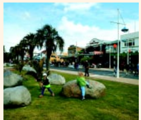
High quality public realm – The redevelopment of the Tauranga downtown waterfront created a key attraction and enhanced the economic vitality of the central city.