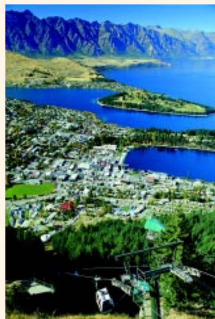
Local character – Queenstown has a unique character that combines a stunning landscape of mountains and lakes, a vibrant town centre, leisure pursuits and a healthy tourist-based economy.