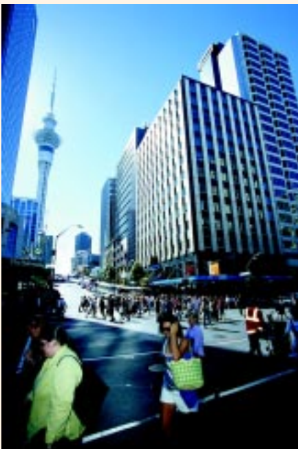
Density – Often it is the densest parts of cities, such as downtown Auckland, which have the greatest vitality and sense of excitement.

An Italian study showed that sprawl tends to raise transport costs. “Diffused, sprawling development” is associated with higher economic and environmental costs of mobility, and with low use of public transport. Density appears to have an impact significantly through influencing the average trip time of public transport. Camagni et al, 2002