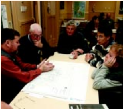
User participation – Planning workshops provide an opportunity for users to provide input into decision-making processes.

Evidence points to the need for good management of the user participation process if it is to be effective. Otherwise the result may be gridlock, or poor outcomes reflecting narrow or vested interests at the expense of the wider public interest. A clear brief for participants, the selection of representative participants, background research and analysis, and experienced facilitation are all shown to be helpful in achieving effective user participation.