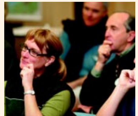
User participation – Public consultation is one form of user participation.