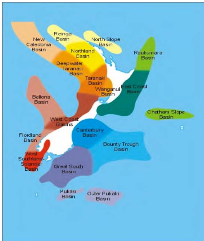
Figure C2.1: Hydrocarbon Basins in New Zealand's EEZ.

Although Taranaki is the most explored and commercially successful of the New Zealand Basins (with 350 exploration wells drilled to date), it is still relatively under-explored by world standards. Increasing levels of exploration over recent years have led to an enviable success rate for wildcat drilling and a commercial discovery success rate of one in three in the Taranaki Basin based on recent exploration activity. 5 Offshore discoveries have also been very successful with Pohokura in 2000, and Tui and Karewa in 2003.