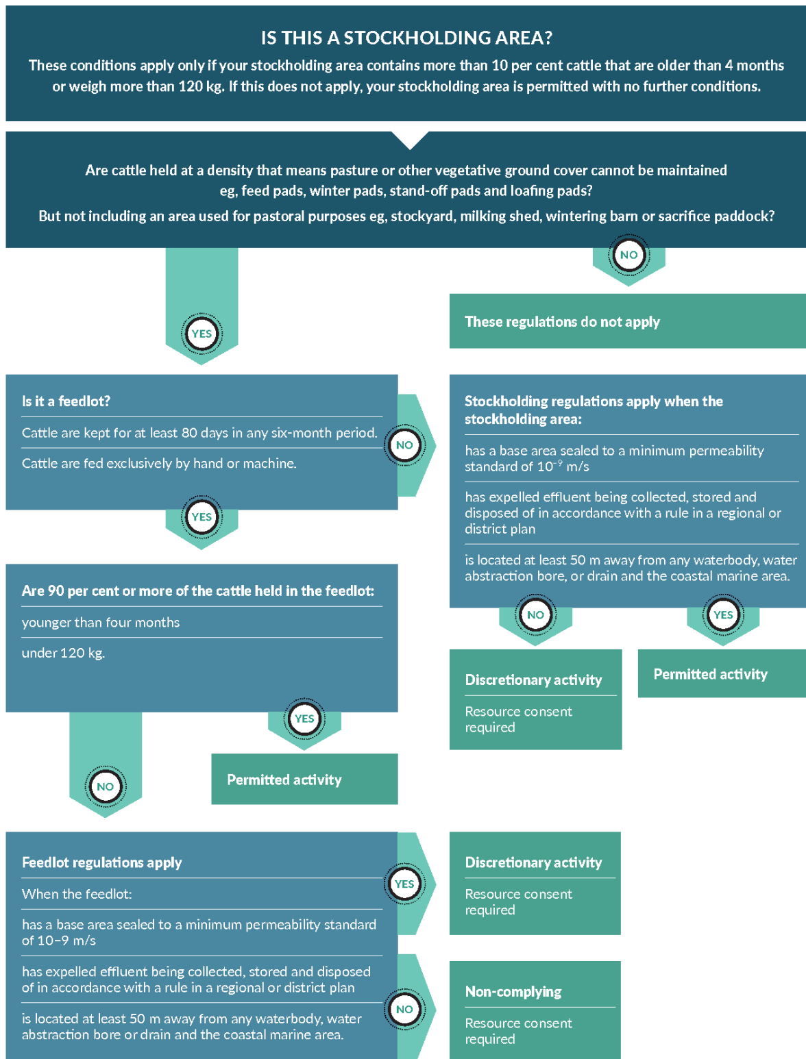
Figure 1: Permitted, discretionary and non-complying activities