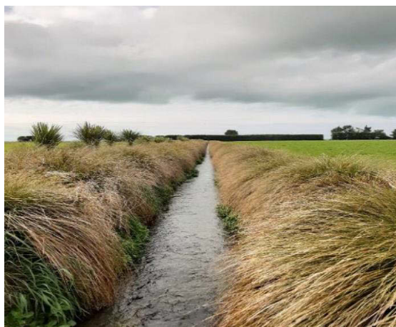
Left: Waingongoro Catchment, South Taranaki (submitted by the Waingongoro Catchment Group to show effective stock exclusion and riparian work with one- to three-metre buffers). Right: Waimanu Farm stream, Canterbury (submitted by MHV Water, Ashburton showing the effectiveness of a two-metre planted setback).