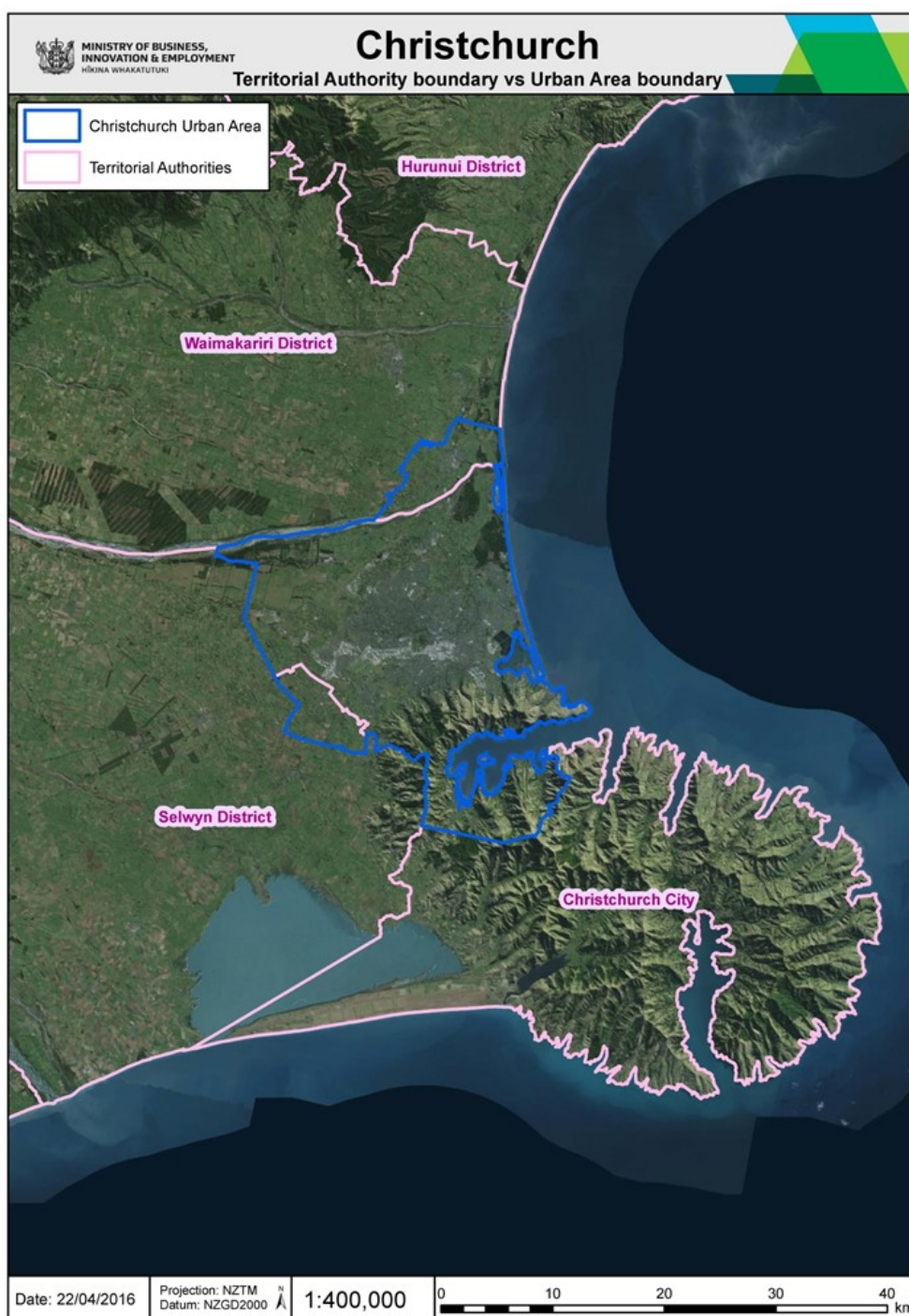
Figure 2: Councils and the Christchurch Main Urban Area

For example, the jurisdictions of Christchurch City Council, Waimakariri District, Selwyn District and Environment Canterbury are included in the Christchurch Main Urban Area. Figure 2 illustrates the boundaries of the three territorial authorities against this main urban area.